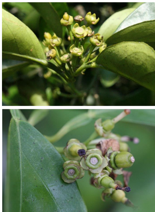
Fig. 2. Persistent calyces on inflorescences produced following infection of flowers by Colletotrichum acutatum . Note that many of the fruitlets have abscised revealing enlarged and swollen floral discs. Some fruitlets may remain attached, but never develop.

Agostini et al. (1992) differentiated the strains of Colletotrichum occurring in Florida and designated them as slow-growing orange (SGO) for the pathogen of PFD, KLA for isolates causing anthracnose on Key lime, and fast-growing gray for the saprophyte and postharvest pathogen. They found that the KLA isolates produced all the symptoms of PFD when inoculated on sweet orange flowers, but SGO did not produce typical lime anthracnose symptoms on Key lime leaves. On the basis of morphology and mitochondrial RFLP analysis, Brown et al. (1996) determined that the causal agents of PFD and KLA were C. acutatum J.H. Simmonds and differentiated it from the common saprophyte and postharvest pathogen, C. gloeosporioides . However, Lima et al. (2011) subsequently found that in some cases in Brazil PFD could be caused by C. gloeosporioides , but it was not as aggressive as C. acutatum . McGovern et al. (2012) also reported that the disease in Bermuda was caused by C. gloeosporioides . Nevertheless, the primary pathogen in almost all areas including Brazil is C. acutatum . Brown et al. (1996) speculated that PFD may have developed in Florida and other areas after C. acutatum moved from Key lime to sweet orange.