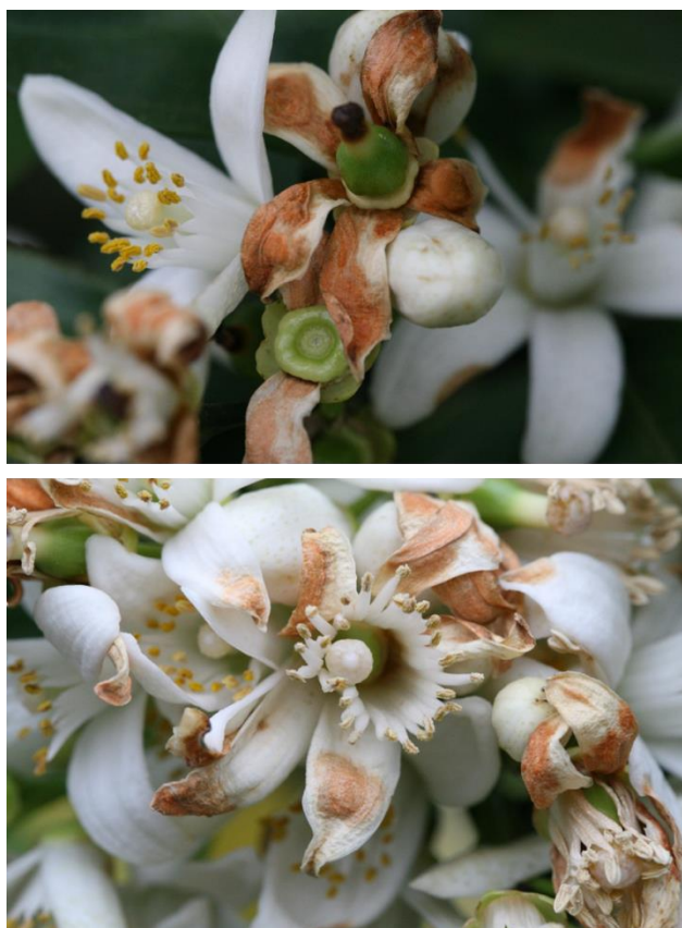
Fig. 1. Flowers affected by postbloom fruit drop, caused by Colletotrichum acutatum . Note the orange-brown lesions on the petals and concentric rings of acervuli formed on the older lesions.