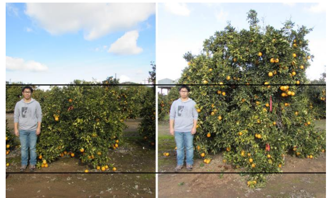
Fig. 1. Effect of citrus dwarfing viroid (CDVd) on overall tree size. CDVd-infected trees are noticeably small in size (left image) than non-infected trees (right image). Graduate student was included in the image to allow an effective visual comparison. Images were taken in January 2016.

Visual inspection of the 1998 CDVd trial, navel orange trees on ‘Rich 16-6’ rootstock, revealed that CDVd-infected trees maintained their overall smaller size compared to the non-infected controls 20 years after planting (Vidalakis et al. 2011) (Figure 1).