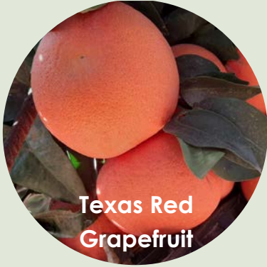
Texas Red Grapefruit