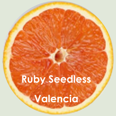
Ruby Seedless Valencia