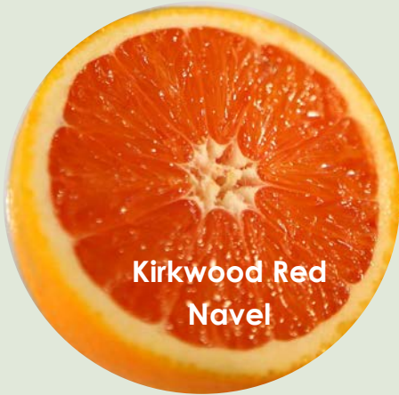
Kirkwood Red Navel