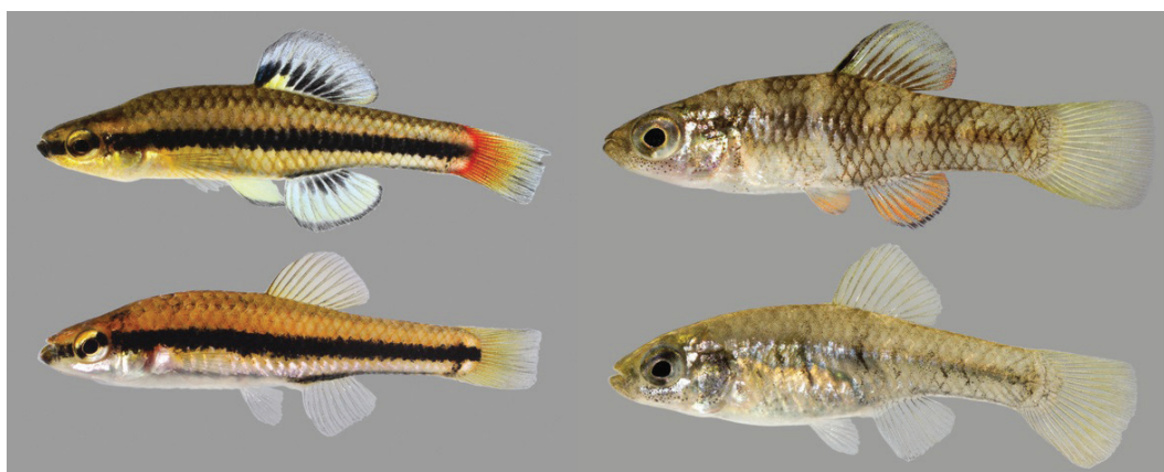
Figure 4 Side-by-side photographs of male ( top ) and female ( bottom ) Bluefin Killifish ( left ) and Rainwater Killifish ( right ) from Florida. Photos reprinted with permission: Zachary Randall, Florida Museum of Natural History (UF 236230 and UF 238088).