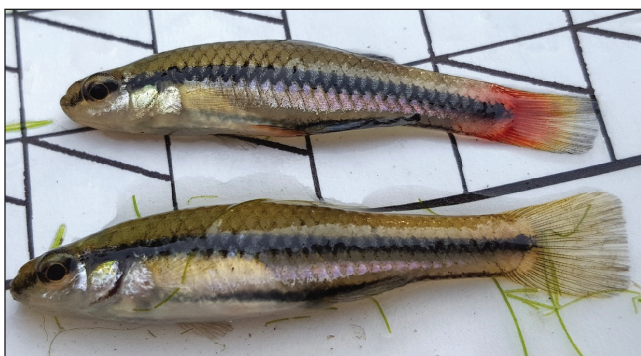
Figure 3 Photograph of the first Bluefin Killifish captured at the Delta Cross Channel on October 10, 2017.

the manufacturer’s guidelines. Sanger sequencing was conducted by QuintaraBio (Richmond, California).