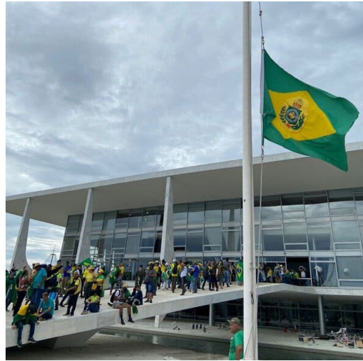
Figure 4. Rioters hoist the flag of imperial Brazil in Brasília on January 8, 2023.

There is of course much more to be explored here—particularly when it comes to the paradoxes of monarchist and other elements of the right. In Brazil, as elsewhere, the marriage of populist social conservatism with elite economic liberalism remains a puzzling, contradictory, and unstable element—one that has troubled scholars for generations, myself included. The complex interactions of historical Catholic traditionalism, modern neoliberalism, and economic populism appear to have entered an even more inscrutable and unpredictable phase, with ongoing and new fractiousness between these perspectives. 103 This includes the seemingly paradoxical presence of social and racial minorities among monarchists. Like prominent black and brown Republicans in the United States, these Brazilian individuals likely do not represent a sizeable proportion of the royalist right—but they are visible and vocal. One young black monarchist in Brazil justifies his conservatism with the time-honored argument that black rights initiatives are not only wrong-headed but unpatriotic—that is, un-Brazilian. 104 Similarly, even as Bertrand dismissed “homosexuality as a defect,” a smattering of self-styled “Brazilian LGBTTT monarchists” published a letter arguing that