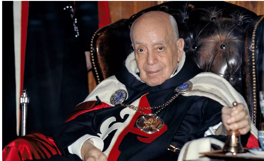
Figure 3. TFP founder Plínio Corrêa de Oliveira wearing the organization’s trademark vestments.

The belief that God, in fact, calls monarchists to a fuller “restoration of Christian civilization” is a longtime hallmark of restorationists and other extreme-right groups. 50 Their vision continues to include heralding the medieval Crusades as an aesthetic-cum-political model for regaining a lost authoritarian Christian ideal. TFP members have, (in)famously, been marching and congregating in dramatic organizational “habits” (designed by the founder and imagined as recreations of Crusader garb) for decades (figure 3).