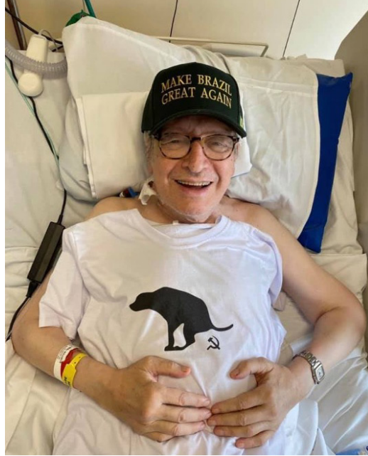
Figure 2. Olavo de Carvalho, pictured shortly before his death in January 2022, wearing a Brazilianized version of a “MAGA” hat.

In other words, for monarchists, Brazil’s mythic past takes an extreme yet foundational form, granting the Bragança regnum (and by extension ongoing socioeconomic hierarchies) divine right or sanction according to the logic that racial inequalities—especially the oppression of Indigenous and Afro-descended Brazilians—can be historically and theologically justified . To take perhaps the most popular version of this among monarchists and other conservatives, such inequalities inhere in Brazil in a natural and positive way, uniting the “faith and entrepreneurial spirit of the Portuguese” with the “intuition of the Indian” and the “strength, goodness, warmth, and loyalty of the black race.” 31 Monarchism does not supply these justifications alone—rather, monarchists have been articulating such rationalizations for white patriarchal hierarchy