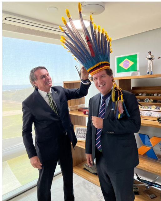
Figure 1. Tucker Carlson and Brazilian president Jair Bolsonaro.