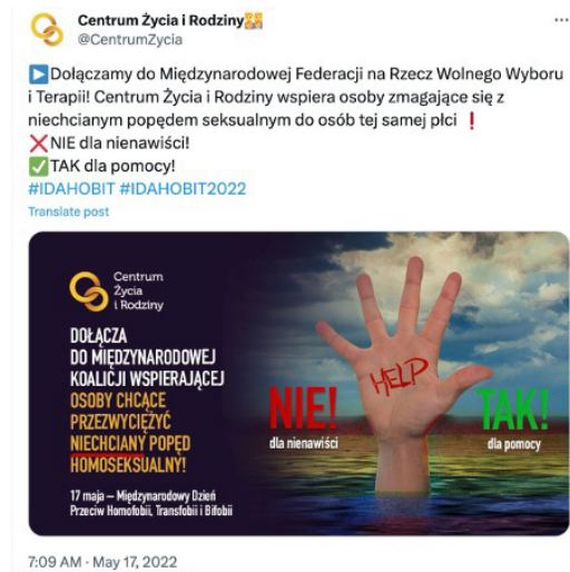
Figure 1. Twitter post by the Center for Life and Family on May 17, 2022, the International Day against Homophobia, Transphobia, and Biphobia. 3

Counselling Choice! The Center for Life and Family supports persons struggling with unwanted sexual attraction toward people of the same sex!” The final exclamation mark is in red, followed again by the “NO to hate!” and “YES to help!” slogans.