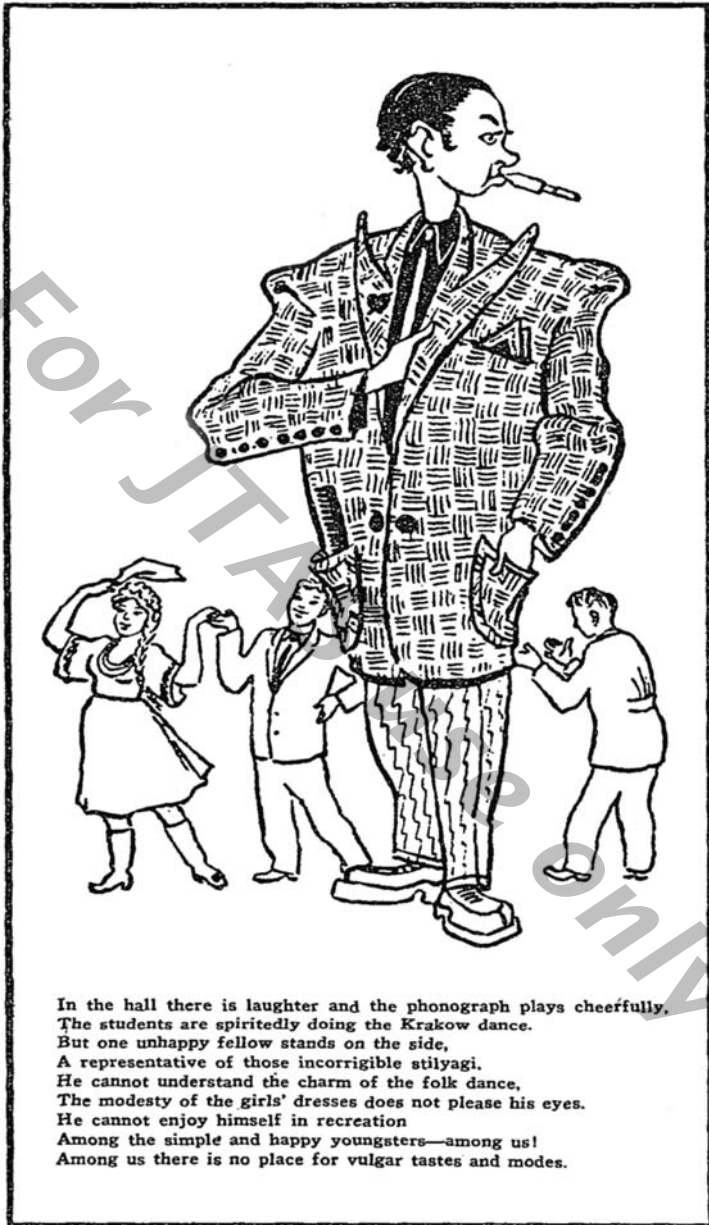
Figure 28. A Soviet newspaper's caricature and denunciation of stilyagi . New York Times , January 11, 1953.