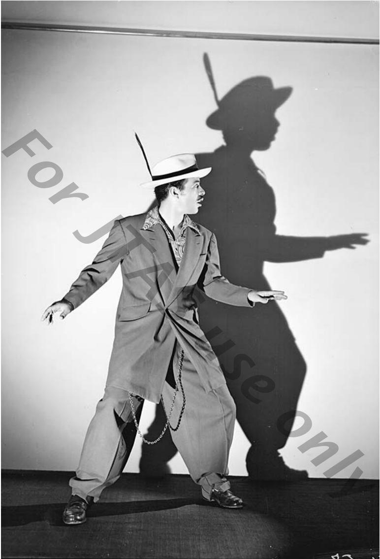
Figure 26. Germán Valdéz as the Mexican pachuco “Tin Tan,” in a publicity shot by Simón Flechine, known as Semo.

©(329514). CONACULTA. INAH-SINAFO-FN-Mexico.