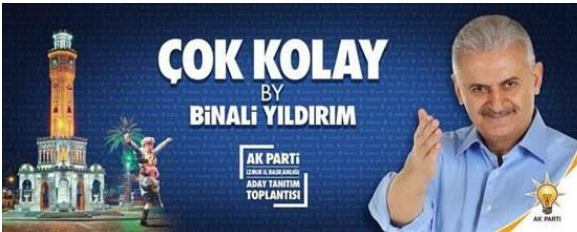
Figure 8. Çok Kolay by Binali Yıldırım —an AKP banner containing a bilingual pun at a rally in which Erdoğan appeared as a giant hologram (January 26, 2014).

rocking his government, Erdoğan appeared at a rally in İzmir as a gigantic hologram, in order to support the municipal election bid of Binali Yıldırım, whose slogan is a bilingual pun in the spirit of Gezi: Çok Kolay (Very Easy) by Binali Yıldırım (see Figure 8). Both Hollywood-inspired marketing slogan and media production trope, the small-font, small-case, italicized “by” in Binali Yıldırım’s slogan codes for his initials, projecting the self onto a ubiquitous American signifier, paralleling Erdoğan’s projection of power and presence through the use of a Star Wars–like hologram. 79 The dangers of appearing westoxicated, on the other hand, have been mitigated via the image of a male folk dancer to the left of the banner, operating like the auntie in Gezi banners, to ground Yıldırım in Turkish authenticity. The use of bilingual humor and Hollywood tropes by an AKP campaign challenges easy binary oppositions between the educated, cosmopolitan protestors and the backwards, village-bound AKP officials and supporters, as well as the possibility of a clean separation between the institutional and the vernacular.