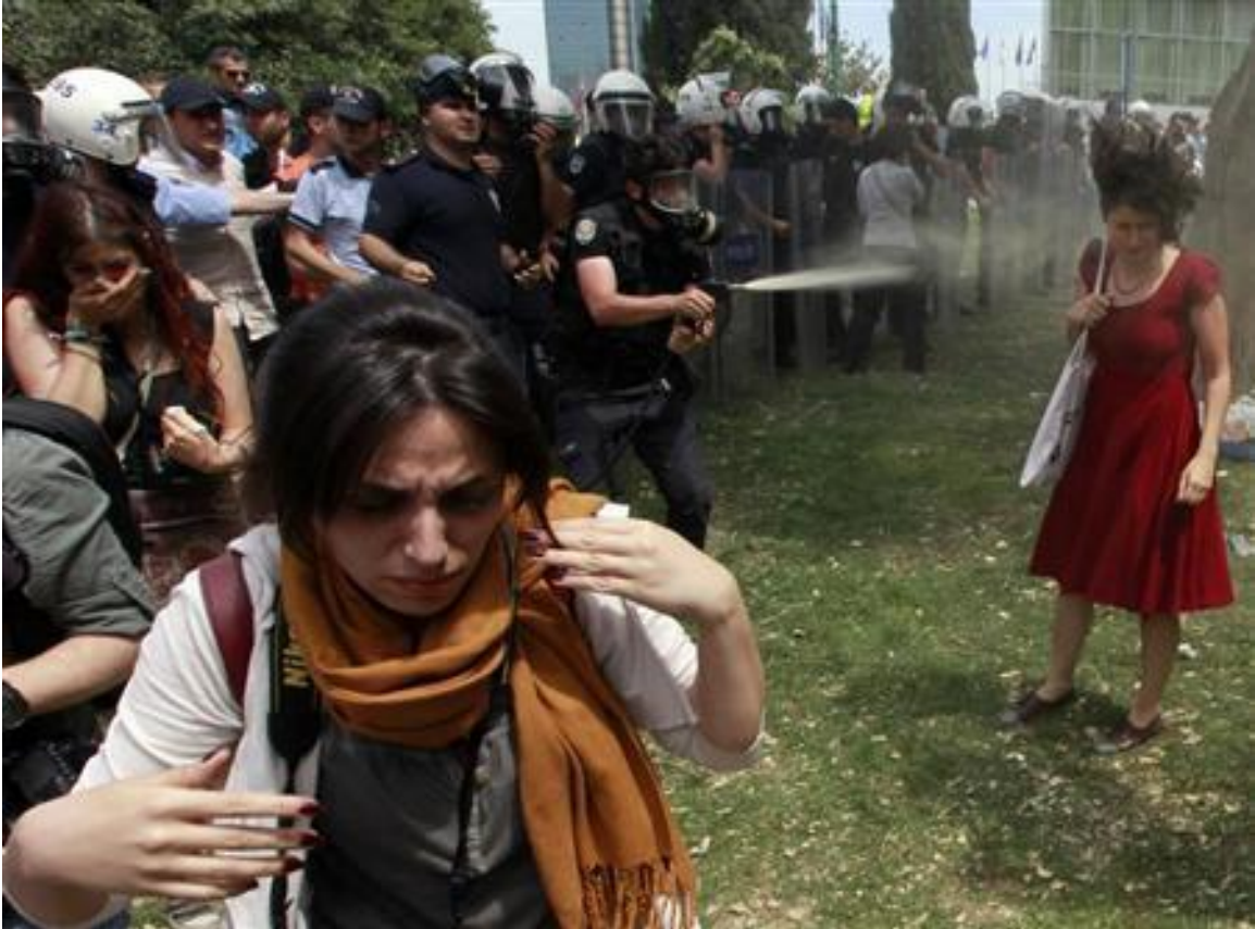
Figure 4. “Woman in Red,” May 28, 2013.

Following a series of defiant speeches by Erdoğan and a brutal dawn raid on May 30, the streets of Istanbul (and increasingly other Turkish cities) filled with protestors of various backgrounds; the police fought back brutally with the use of water cannons, tear gas, and pepper spray, leading to more than one hundred injuries on May 31 alone. On July 15, Turkish Doctors Association announced that 4,177 individuals had been wounded to that date in Istanbul alone; almost eight hundred were due to gas canisters being used illegally as weapons. 18 Eight people were dead, and these would not remain the only losses. 19 The excessive and sometimes clearly illegal use of force by the police and the lack of proper legal oversight have been documented and condemned by multiple internal and external organizations, including Human Rights Watch and Amnesty International. 20 The intensity of the government’s reaction, both foretold and symbolized by the bent knees and the forward-leaning posture of the officer in the “woman in red” photo, stemmed in part from the casting of the protestors as foreign forces. Not only did Erdoğan read the events as a “civil coup” overseen by outside interests, including the famous Hungarian American speculator George Soros and an ambiguous “interest rate lobby,” there are