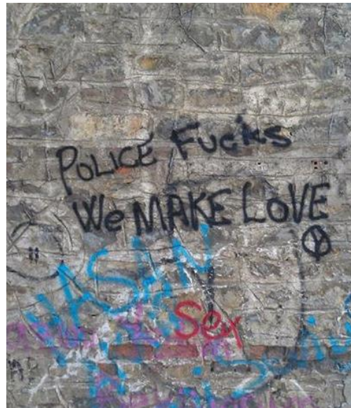
Figure 3. English-language protest graffiti spotted in Saskinbakkal, Istanbul—a posh commercial district on the Asian side of Istanbul (July 2013). A transnational and multicultural reworking of the Vietnam-Era slogan, “Make Love, Not War,” this text constructs a civilizational binary that is further reinforced through the use of English.