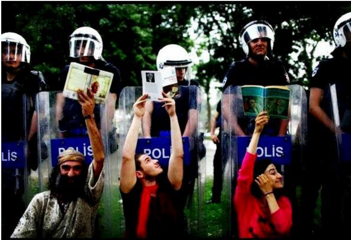
Figure 5. Image of “disproportionate intelligence” at Gezi Park, shared on Twitter by @elifzelaliyik on May 30, 2013.

(the Turkish equivalent of The Onion ), regarding antigovernment protests at Middle East Technical University, posted on December 29, 2012. 31 While shared multiple times on Facebook and Twitter at the time, this gag apparently didn't get its own hashtag until late May 2013 in relation to the Gezi events. By early June 2013, there were multiple Facebook groups and multiple entries on the popular wiki Ekşi Sözlük (Sour Dictionary) celebrating the use of “disproportionate intelligence” as opposed to the police's use of “disproportionate force.” 32 Like the graffiti opening this section, “Police Fucks, We Make Love,” the idea of disproportionate intelligence, in juxtaposition to brute force, aligned the protestors with cultural capital and cast the police as unrefined, animalistic, uneducated cavemen. This quip soon found its way to conventional media critical of the government, such as the left-leaning Kemalist newspaper Cumhuriyet , which picked up the phrase “disproportionate intelligence” around June 7 and used it nineteen times in approximately two months. 33