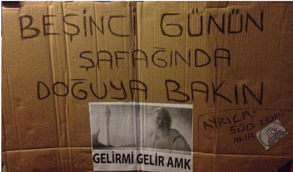
Figure 6. An example of humor and incongruity. Handmade poster shared on BuzzFeed.

As Hikmet Kocamaner has written in an exceptionally astute piece on the gendering of the protests, Gezi protestors sought to mobilize images of aunties and mothers, in part, to counter AKP’s usurpation of the rhetoric of the family, which cast them as unruly children who must be taken home by their mothers: “the protestors