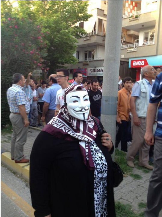
Figure 1. “V for Teyzetta,” shared on Twitter by @sarpapak81 on June 2, 2013.

fissures mentioned above. How do we make sense of all this play with the familiar and the foreign in visual and textual humor in the service of a people's movement? Why claim both traditional aunties and American pop culture in challenging a democratically elected, Islamic-leaning, neoconservative government, the incumbency of which has been marked by a privatization and urban development frenzy?