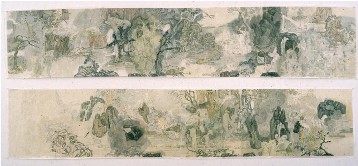
Figure 2. Yun-Fei Ji, The Garden of Double Happiness , 2001. Ink and mineral pigment on mulberry paper, 40” x 108”. Collection of Ninah and Michael Lynne. Copyright Yun-Fei Ji.

vehicles abandoned in the landscape; other mutant vehicles and science-fiction machine parts that had no discernible purpose; circa-1950s gas pumps; ominous helicopters whirring through the air at an angle; tilted basketball hoops; bereft cartoon figures; and scattered bones; to mention just a few examples.” 19 Other examples occur in one of the most complex and brilliant of the group of scroll paintings, The Garden of Double Happiness (2001), in name and content an homage to Hieronymus Bosch with no stretch of the imagination (see Figure 2). Sexual perversions with or by half-human, half-animal creatures and concocted grotesques are embedded everywhere in the landscape. The horizontal scroll is washed in pale browns, tans, blues, greens, and pinks, both a reference to traditional painting and a way of emphasizing the fading landscape, while a marvelous array of pen and brush patterns evokes nature’s beauty. While bringing to mind a distant history, things like the overturned jeeps and the pathetic figures wearing dunce caps are part of what returns us to the recent past. The intelligentsia was made to don such caps as part of their torment during the Cultural Revolution.