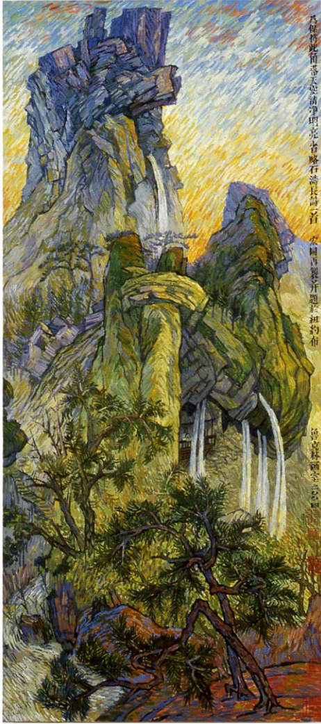
Figure 11. Zhang Hongtu, Shitao-Van Gogh #7, 2004. Oil on canvas, 72" x 32 ½".