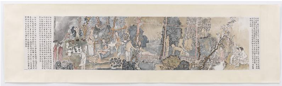
Figure 4. Yun-Fei Ji, The Garden Party , 2009. Watercolor and ink on Xuan paper mounted on silk, 19 \frac{7}{8} " x 69 \frac{1}{2} ". Copyright Yun-Fei Ji. Courtesy of the James Cohan Gallery, New York.

of the dead and the grotesques that previously inhabited his landscapes. As examples, the figures in The Three Gorges Dam Migration , Blind Stream (2008), The Wait (2009), and The Guest People (2009) depicting displaced persons, and The Garden Party that images the depraved behavior of the powerful, are drawn in a fluid realist style forging the Bosch-like nightmare content of the earlier scrolls (see Figure 4). Turpitude gives way to lethargy expressed in the bodies of the dislocated as well as the self-indulgent. All these paintings are more colorful than past work, and the calligraphic strokes that form the landscape are even more multifarious than in the past paintings. Most of the scrolls have columns of Chinese writing on the sides, a motif that binds them even more closely to the classical tradition.