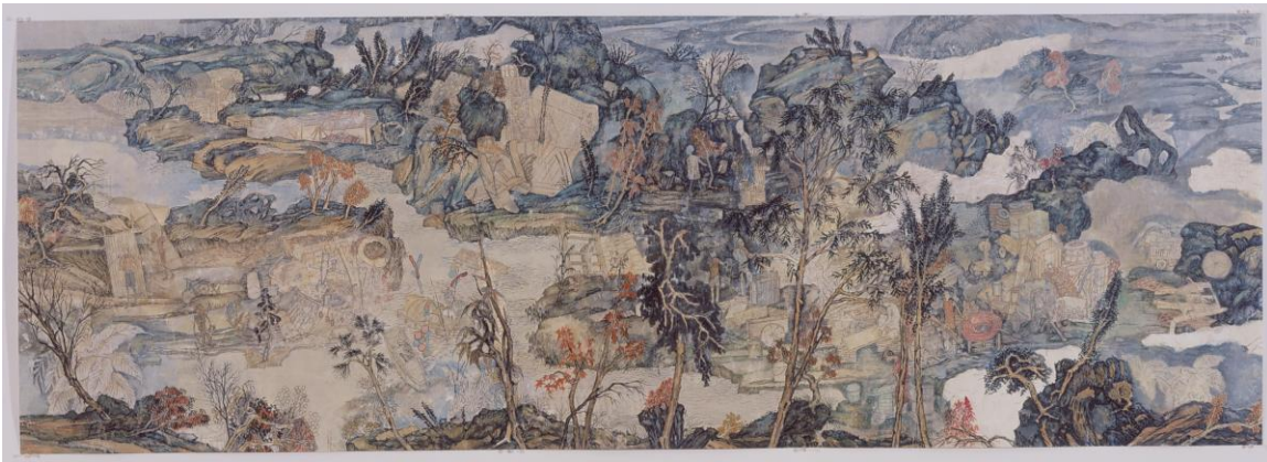
Figure 1. Yun-Fei Ji, The Empty City: Autumn Colors , 2003. Mineral pigment on Xuan paper, 31½" x 92½". The Judith Rothschild Foundation Contemporary Drawings Collection Gift, Museum of Modern Art, New York. Copyright Yun-Fei Ji.

Upon first perusing Ji's ink wash and mineral pigment paintings on handmade paper in catalogue form, I not only wanted to engage the originals but was also prompted to add a cruise on the Yangtze River to see the Three Gorges Dam project on my trip to China in 2008. After I returned, the first painting of his that I actually saw, The Empty City: Autumn Colors (2003) was on exhibition at MoMA in New York (see Figure 1). 12 I was engaged by the work on many levels: the delicacy of the watercolor; the complex brushwork and allegiance to classical landscape painting; and in particular the content that imaged the devastation to land and people brought about by the Three Gorges Dam project—in the name of economic and industrial progress.