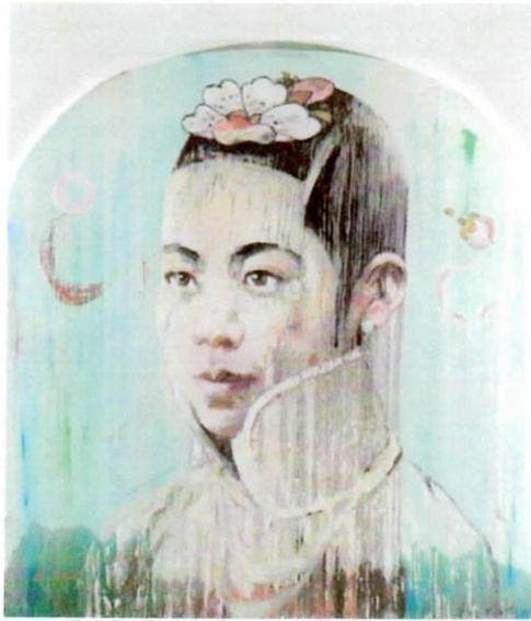
Hung Liu, Visage I, oil on canvas, 51 x 48 inches, 2004