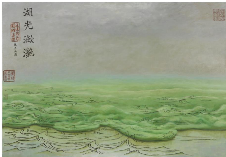
Figure 12. Zhang Hongtu, Re-make of Ma Yuan's Water Album L (780 Years Later), 2008. Oil on canvas, 50" x 72". Courtesy of the artist.