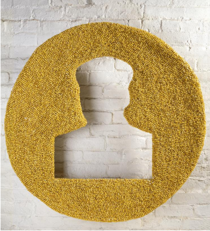
Figure 9. Zhang Hongtu, Corn Mao , from the Material Mao Series , 1992. Corn kernels on plywood, 39” in diameter. Courtesy of the artist.