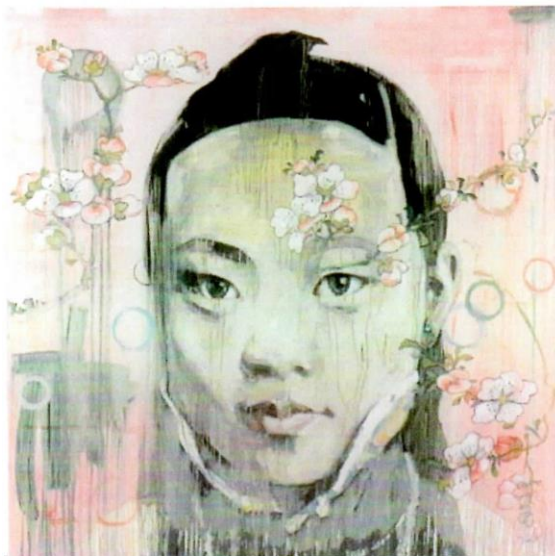
Hung Liu, Visage III, oil on canvas, 72 x 72 inches, 2004