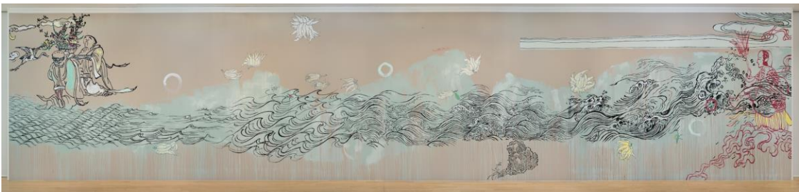
Figure 8. Hung Liu, Silver River , site specific May 2013. Gallery-length mural (disappeared September 29, 2013), acrylic on drywall. San Jose Museum of Art.

In 2013 Hung Liu was celebrated with retrospective exhibitions at the Oakland Museum of California and Mills College in Oakland. Recent works were part of the exhibition Questions from the Sky: New Work by Hung Liu at the San Jose Museum of Art. New modes of working are revealed in two paintings that are performance pieces. In Silver River , Liu spent a week in the museum creating a gallery-length painting of “ghost” flowers and undulating calligraphic drawings and her signature drips. In Four Cantos , she painted an abstract work in front of the audience, inspired by a simultaneous video projection of a film of revolutionary movies she saw when she was