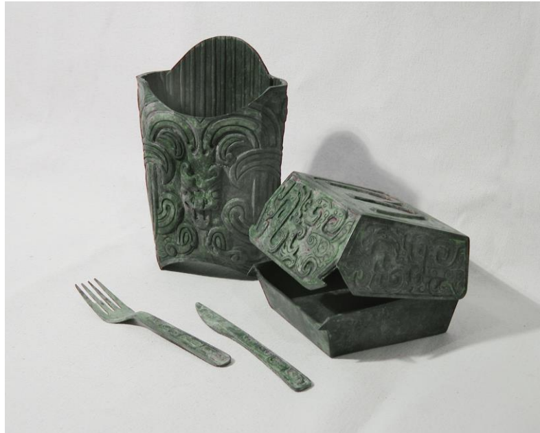
Figure 10. Zhang Hongtu, Mai Dang Lao , 2002. Cast bronze, actual size. Courtesy of the artist.

house as the institutional framework of the global art market responsible for hyping the latest fad and reducing cultural items to monetary values. The catalogue works are visually intriguing and conceptually clever, in keeping with Political Pop and cynical realism being produced by contemporary artists in China in the 1990s. However, Zhang is more overtly political as he critiques both capitalism and the Chinese government. He is also less interested in appropriating the signs of American Pop art often included in works by artists in that movement in China.