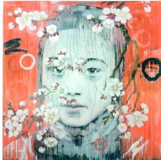
Hung Liu, Visage IV, oil on canvas, 72 x 72 inches, 2004