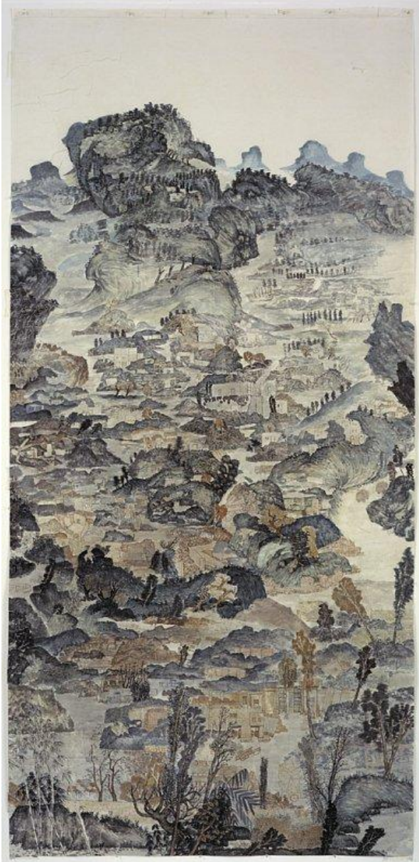
Figure 3. Yun-Fei Ji, Below the 143 Meter Watermark , 2006. Mineral pigments and ink on mulberry paper, 118½” x 56⅛”. Copyright Yun-Fei Ji. Courtesy of the James Cohan Gallery, New York.

The 10-foot scroll The Three Gorges Dam Migration is an artist’s book hand-printed in China in 2008–2009 from five hundred carved woodblocks—the technique over a thousand years old—made by Rongbaozhai, one of China’s most famous printers and publishers. It is the seventh book commissioned by the Library Council of the Museum of Modern Art in New York, a joint project of the publishing house and the museum. In a 2010 exhibition at the James Cohan Gallery in New York titled Mistaking Each Other for Ghosts , 24 Ji showed this work alongside ones he had made in the eight months he spent in Beijing while the scroll was being printed. His figural drawing style has always been indebted to the socialist realism he learned in China; however, in many drawings and finished watercolors from the Beijing trip, Ji overtly emphasizes the socialist realist approach and forgoes the skeletal renditions of ghosts