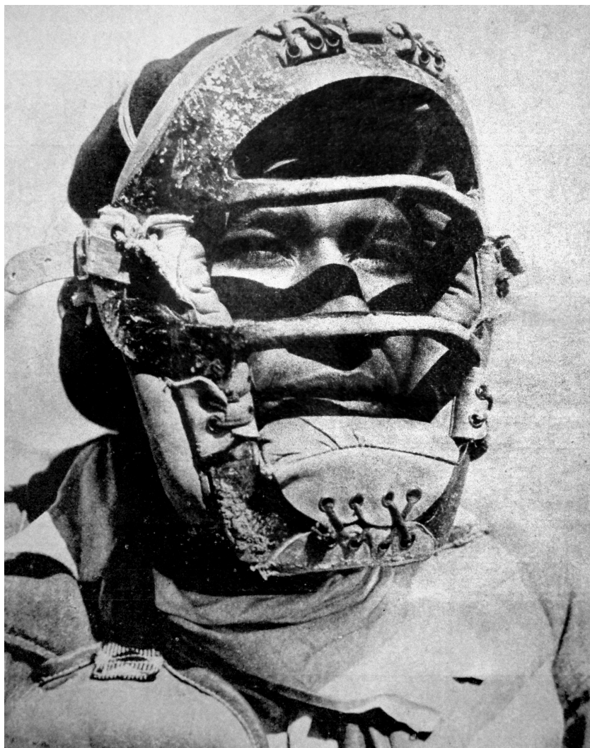
Figure 4.6. “A ‘Yaqui’ Baseball Player—Promoting Modernity and Solidarity.” Inter-American Monthly, February 1944.