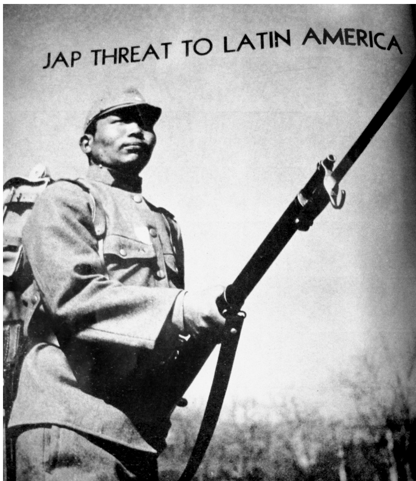
Figure 4.8. Throughout the Americas, propaganda portrayed ordinary Japanese children, schools, and merchants as a subversive threat. By reconfiguring ordinary Japanese of the Americas, they became, in the eyes of the public, the “Jap Threat to Latin America,” as pictured in this image. Inter-American Monthly .

Paulo and Paraná in areas considered so remote as not to pose any security risks. The logistics of rounding up 200,000 Japanese made it unrealistic, and Brazilian authorities also understood that Japanese farmers were vital to their agricultural industry. 46 Nonetheless, Brazil, under the dictatorship of Getúlio Vargas, implemented nationalistic policies that closed down