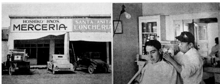
Figure 4.5. Japanese fifth column fears. Inter-American Monthly , January 1943.

trade as an accessible means to earn a living and a significant number were employed in this manner. Nonetheless, the images were powerful in their insinuation that all Japanese were suspect and were used as part of the public's indoctrination into the Axis threat in the Americas. The OIAA also encouraged mainstream forms of popular culture, such as the Saturday Evening Post , to create exposés on the Japanese population throughout Latin America using identical techniques to the Inter-American Monthly that reinforced to the public the wary and suspicious nature of the Japanese population. These images also highlight OIAA's prevalent use of popular culture, reportorial journalism, and propaganda.