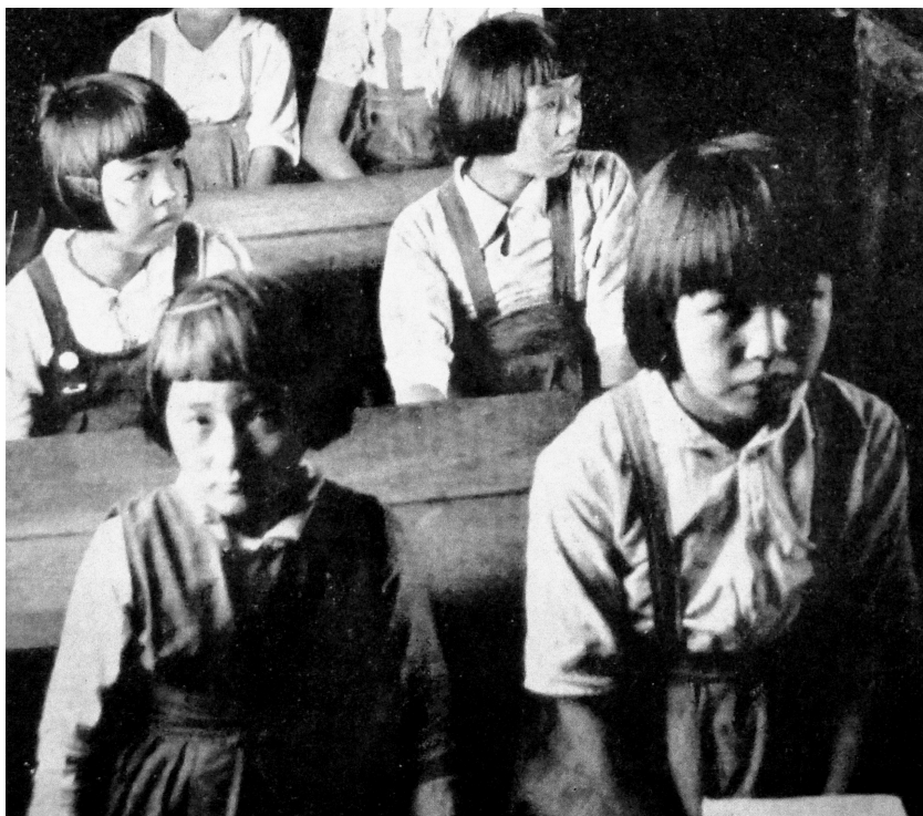
Figure 4.2. The title of the article where this picture appeared was “Jap Threat to Latin America.” The actual caption read “Japanese children in class of secret school. Children are often taken to school after midnight to absorb Japanese ideology from saboteurs rattling books. Schools are thorn in the flesh of multi-racial Brazil, whose government tries hard to unify her forty-million children.” Inter-American Monthly , June 1942.

reports by the FBI, or unreliable intelligence gathering. And as figure 4.2 illustrates, even school children were depicted as possible threats to the Americas.