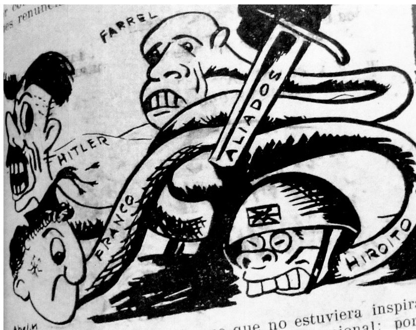
Figure 4.9. Mexican Communist Party propaganda. From Un Programa para Unir Más a la Nación , Archivo General de la Nación, March 1945.

a threat to the Soviet Union and the communist movement, in general. Images like the ones above reveal the importance of art and its use as a propaganda tool. Whether Mexican, United States, Japanese, or German, the state liberally utilized various forms of art as a medium to reach the masses with their message. Nation states understood the power of art and used all means at their disposal to create images that sold their message. 62