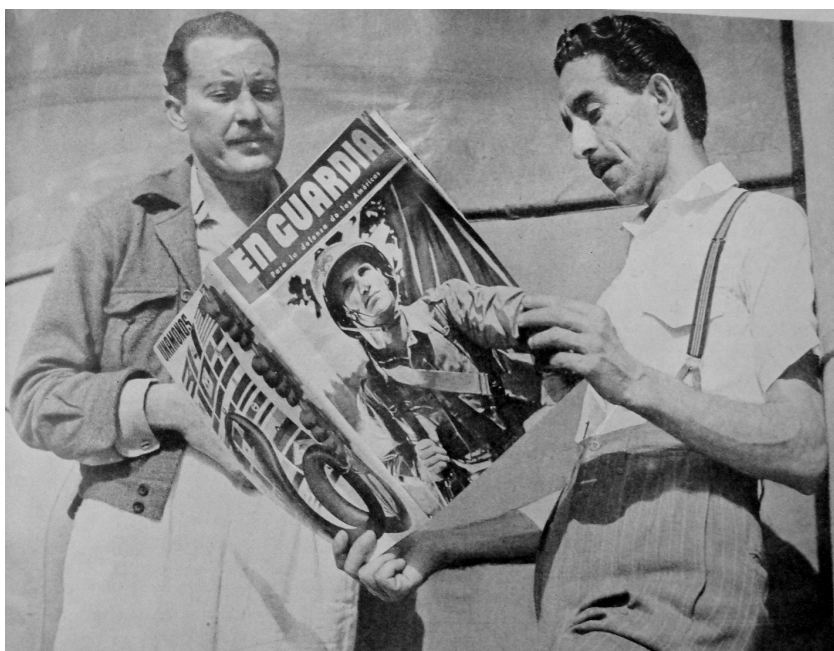
Figure 4.3. Propaganda free-for-all. Inter-American Monthly , September 1944.

These monthly magazines were part of the overall design to promote inter-American cooperation through commercial and cultural interests during the 1940s. In the 1942 inaugural issue of the Inter-American Monthly , Nelson A. Rockefeller, the coordinator of OIAA, wrote an article, “New Economic Frontier,” where he expounded on the need for economic solidarity in order to “secure the hemisphere against the enemies of freedom.” 35 The Inter-American Monthly was designed for popular readership in order to reach a wide audience and in this manner mold and slant general sentiments about the war effort in a pro-US fashion. Central