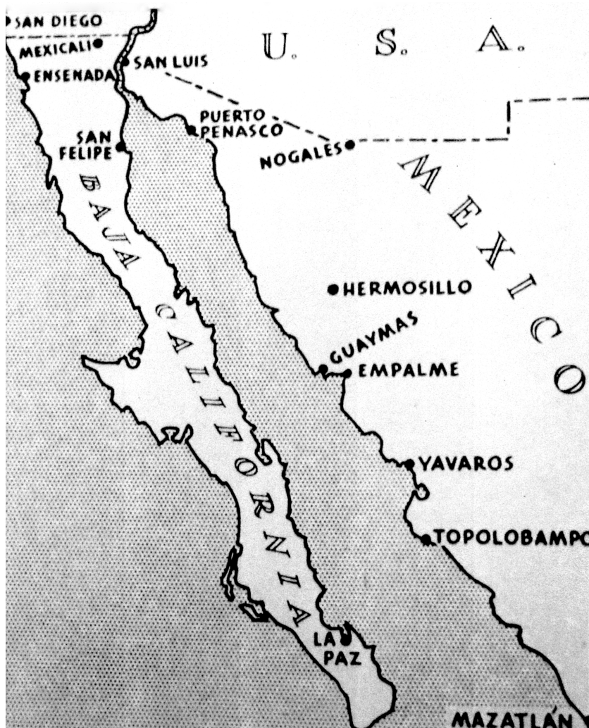
Figure 4.4. "West Coast centers of Jap Activities before Mexican Government Cracked Down on Them." Inter-American Monthly , January 1943

The article provides no evidence of the Hoshiko brothers' involvement in espionage as alluded to and the image taken of the barber with a client not only appeared to have been two Mexicans but also could have been taken almost anywhere in Mexico or perhaps even in the Southwest United States. As mentioned earlier, Japanese Mexicans used the barber