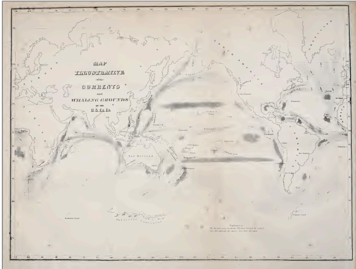
Figure 3: Charles Wilkes's chart of oceanic currents and whaling grounds from the Narrative of the United States Exploring Expedition , vol. 5: 457.

(see Figure 3), as well as Lieutenant Matthew Fontaine Maury of the US Naval Observatory and Hydrography Office, whom Melville acknowledges in a footnote. 78 But even more revealing in this image is the figure of Ahab, surrounded by a proliferation of charts, none of which are singularly capable of revealing the ocean's enigmatic mysteries. Like the maker of the counterpane, Ahab endeavors to “thread” together this “maze” of information, illuminating the elusive patterns of the unfixed ocean in order to guide himself toward his prey. In doing so, the juxtapositions of the sea charts call for newly “effaced” markings and revisions of previous information, similar to the manner in which the careful side-by-side examination of the two Upolu charts produced by the US Ex. Ex. revealed discrepancies that evaded the casual observer's eye and required emendation.