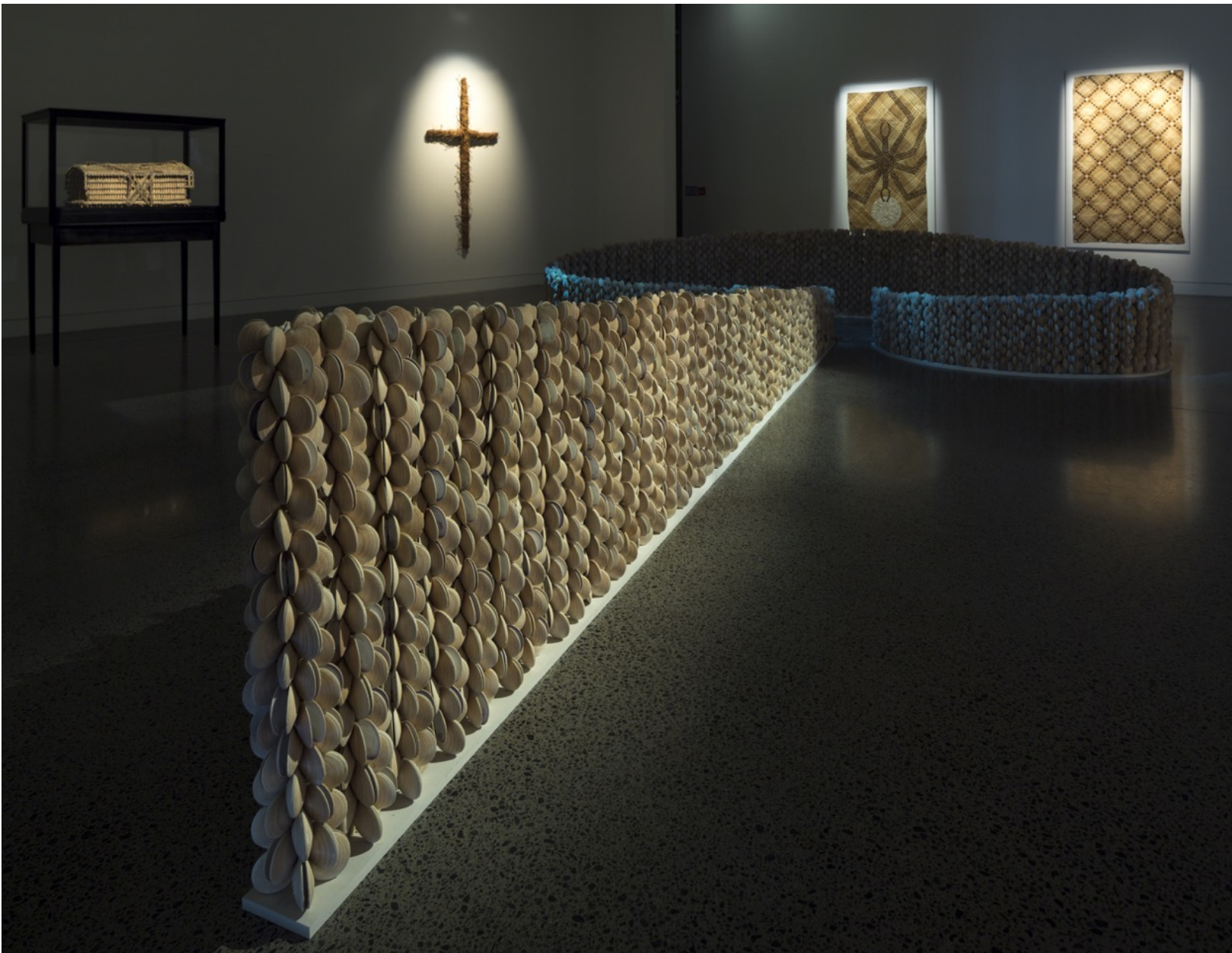
Figure 1. Chris Charteris, Te ma (Fish trap) (installation view, in foreground), 2014, ringed venus shells, nylon, wood, 181 × 291 × 31.5 in. (4600 × 7400 × 800mm). Collection of the artist, photo by Samuel Hartnett.