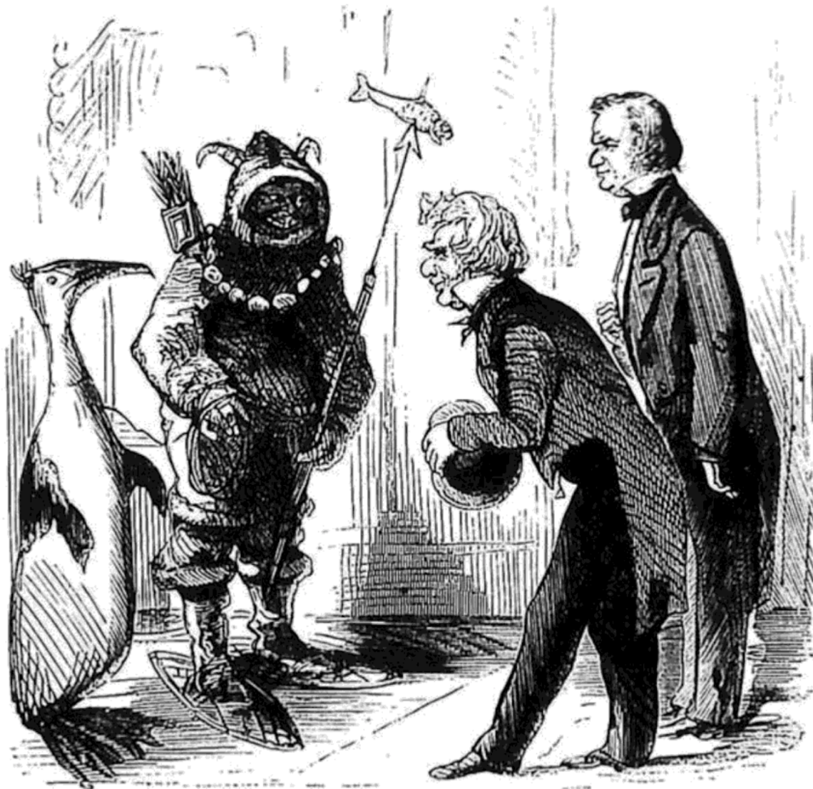
Figure 4. "Our New Senators." Frank Leslie's Weekly Newspaper.