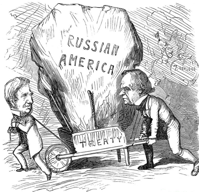
Figure 1. “Preparing for the Heated Term.” Frank Leslie’s Weekly Newspaper , April 20, 1867.

On April 20, 1867, Frank Leslie’s Weekly Newspaper published an editorial cartoon titled “Preparing for the Heated Term” (see Figure 1), which depicts Secretary of State William Henry Seward—the man responsible for orchestrating the purchase—and President Andrew Johnson carrying a large block of ice labelled “RUSSIAN AMERICA,” in a wheelbarrow labelled