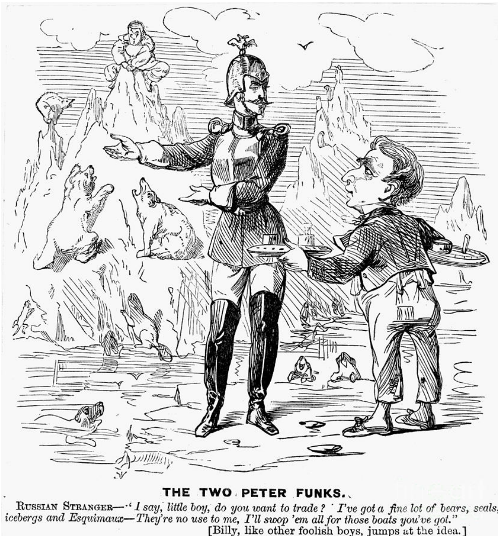
Figure 3. “The Two Peter Funks.” Frank Leslie’s Weekly Newspaper.

“Treaty.” In the background, a Russian diplomat makes off with a seven million-dollar bag of money, and a caption beneath the image reads, “King Andy and his man Billy lay in a great stock of Russian ice in order to cool down the Congressional majority.” This cartoon insinuates that the Alaska Purchase was merely a diversion intended to pacify an incensed American public, a desperate attempt to drum up support on behalf of the immensely unpopular Johnson administration. On the same day, Harper’s Weekly published a similar cartoon by famed illustrator Thomas Nast titled “The Big Thing” (see Figure 2). Nast’s cartoon shows Seward wearing a dress and applying “Russian Salve” to the head of an angry Uncle Sam, who is shaking his fist at a picture of a crowned Andrew Johnson. On the wall behind them hangs a picture of Alaska labelled “Map of the Russian Fairy Land / Only $7,000,000 in Gold.” This map consists entirely of arctic stereotypes: Alaska is a mountainous iceberg with the United States flag flying from its spires; a man holding another US flag is chased by a polar bear. Beneath the cartoon, a caption reads, “Old Mother Seward. ‘I’ll rub some of this on his sore spot. It may soothe him a little.’” Once again, this image presents the Alaska Purchase as nothing more than a strategic attempt to placate an outraged nation.