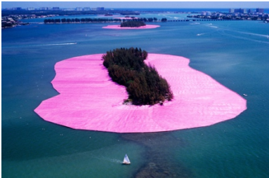
Christo and Jeanne-Claude Surrounded Islands, Greater Miami, Florida, 1980–83 Site-specific installation with polypropylene fabric