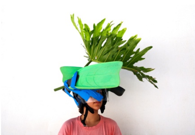
James Cooper Helmet Sculpture #3, 2010 Color photograph 40 × 30 in. (101.6 × 76.2 cm)