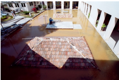
Humberto Díaz Espejismo, 2006 Sculptural installation, view of the piece in 9th Bienal de La Habana, Academia “San Alejandro,” Cuba