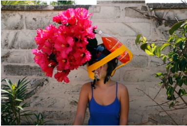
James Cooper Helmet Sculpture #1, 2010 Color photograph 40 × 30 in. (101.6 × 76.2 cm)