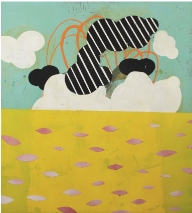
Fidalis Buehler White Cloud Caution Flasher Oil painting on panel 18 x 20 in.