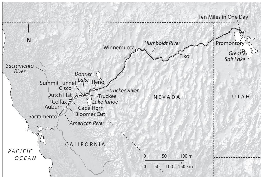
Central Pacific Railroad Line