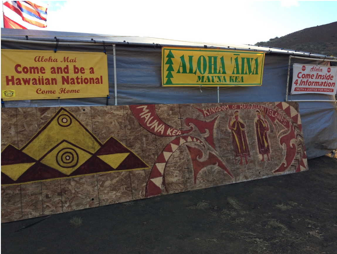
Figure 2. The tarp of the protectors. July 2015.

Hi'i, another protector, was the youngest one there, knowing she had to go back to school in Maui come September. But she was filled with a similar kuleana. She told me of earlier in the year, when protectors had blocked the road to the TMT with stones. "There's this song that was written during the sovereignty movement, about Hawaiians rather starving than giving in. We'd rather eat rocks. So all those pohakus (stones) in the road? They say 'fuck your money, we eat rocks, you go home.'" 53 She was referring to "Kaulana nā pau," a song many Kānaka know extremely well, whose lyrics are a direct refusal of the state's paternalistic attitudes towards Kanaka subjectivity. The allure of assimilation is instead disrupted by the radical alternative of quite literally eating the 'āina. Hi'i's evocation of the song is a sedimentation of Kanaka right to land as a central axis from which sovereignty claims are articulated.