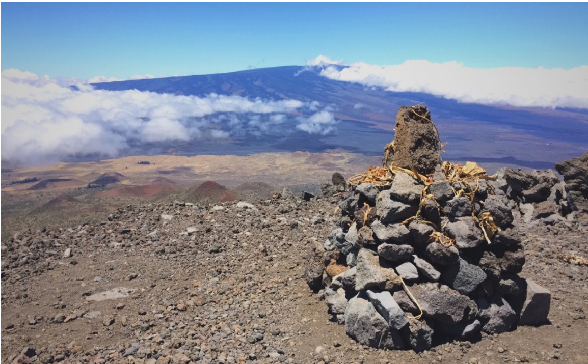
Figure 4. Ahu (shrine) at the summit. July 2015.

The protectors on Mauna Kea recognize a similar strength to their own claims, refuting the naturalized cooptation of Kanaka voyaging knowledges into a Western astronomy narrative of progress. Instead, they theorize a different kind of futurity, an Indigenous future that upholds the continuous and deeply contextual importance of Kanaka place-based knowledges, knowledges that can be seen as science in their own right. Their claims to Mauna Kea are thus, explicitly, claims to sovereignty over land and water that is unlawfully occupied, not an affront to science.