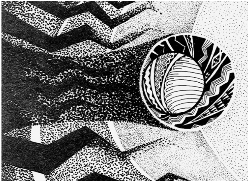
FIGURE 4. Imaikalani Kalahela's Inaspace 3 (2002).