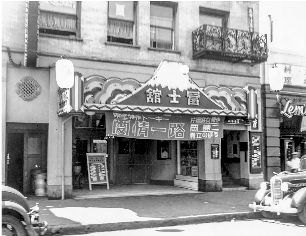
Photograph of Los Angeles's Fuji Kan in 1939.

regularly in the mid-1920s, they were most often coupled with short features ranging from travelogues, educational or industrial shorts, and, as the Sino-Japanese War escalated, propaganda films. Additionally, the Fuji Kan on several occasions exhibited local films , depicting views of the neighborhood and commercial streets as well as community activities, such as swimming competitions and judo matches. Showing local views and recognizable places, these films appealed to audiences' desires for self-recognition or "seeing oneself on the screen." 1 For Japanese excluded from political participation in the United States (as determined by law until 1952), local films presented the audience with an alternative form of public affirmation and recognition.