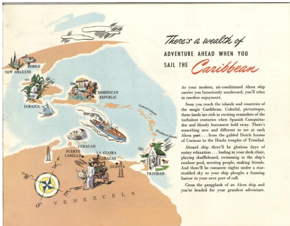
Fig. 1: ALCOA Cruise brochure depicting the Caribbean archipelago (1950s), Mimi Sheller’s personal collection.

In the 1950s the Aluminum Corporation of America (ALCOA) was heavily promoting its extracting business via sixteen-day tourist cruises through the Caribbean region, an area integral to its bauxite mining operations. It promoted these cruises through an imagery of the Caribbean archipelago as a series of cultural and musical stepping stones, easily accessible to the North American tourist (see Fig. 1). Underlying the mobilities of tourists, though, were the mobilities of ALCOA’s freight ships, picking up bauxite from mines in the region or alumina from its refineries to be smelted into aluminum in United States smelters, which fed the metal into the massive military build-up and consumer markets that supported global United States imperialism in the mid-twentieth century. 7 ALCOA was an empire-building company, promoting archipelagic travel through the Caribbean as an ancillary benefit of their vast aluminum empire, premised on the military network of US Navy war ships and bases throughout the region.