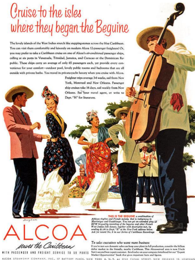
Fig. 2: ALCOA Advertisement (1950s), Mimi Sheller's personal collection.

“Cruise to the Isles where they began the Beguine” proclaimed an alluring early 1950s ALCOA Cruise Ship advertisement (see Fig. 2). Aimed at capturing the imagination and wallets of prospective travelers, the advertisement wove a lyric fantasy describing the region with the flowery prose, “The Lovely islands of the West Indies stretch like stepping-stones across the blue Caribbean” wrapped around colorfully vibrant artistic depictions of local dancers from Martinique and Guadeloupe. 8 ALCOA's promotion invites tourists to join comfortable, leisurely, air-conditioned, and most importantly “modern” freighters or ALCOA passenger ships for a cruise through the region. The