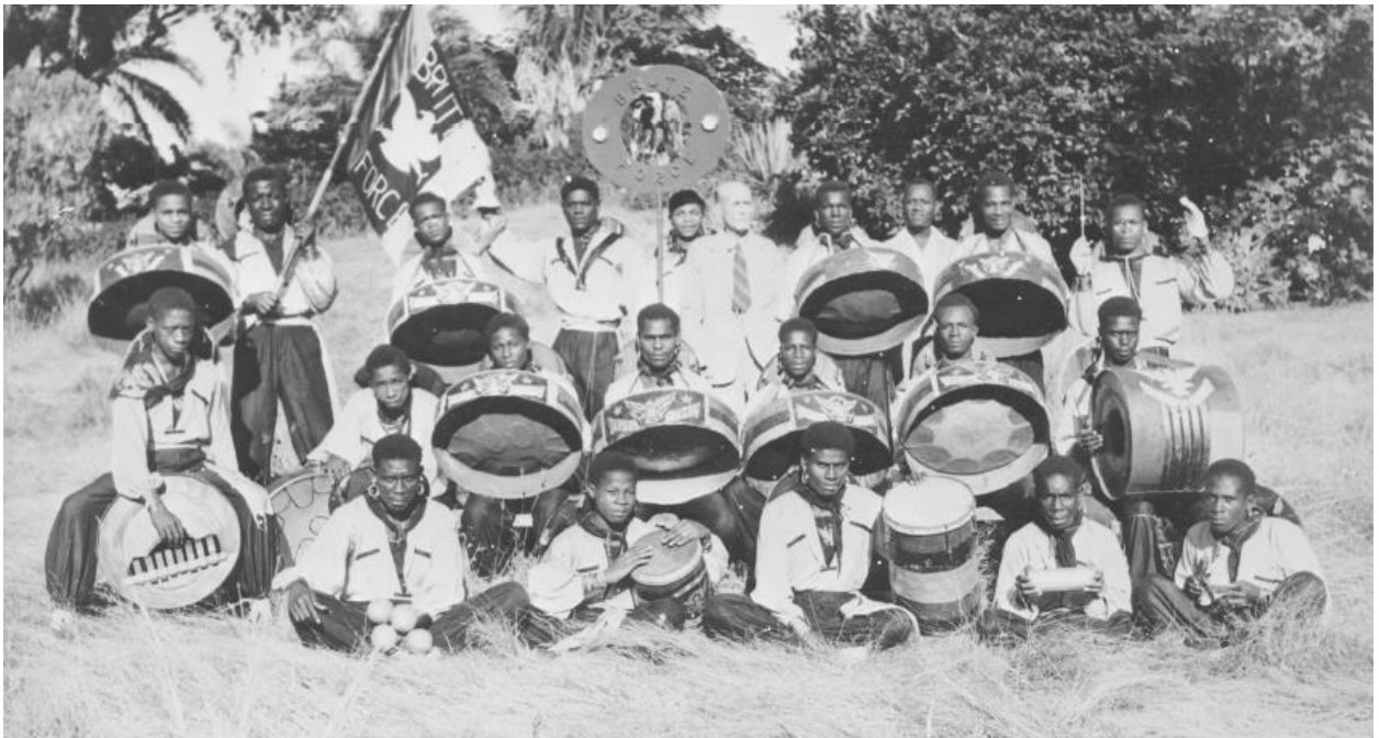
Fig. 5: Brute Force Steel Orchestra (1952).

They further praised the Antiguan steelband movement, stating “In Antigua the steel band has been particularly well developed” and “The Brute Force Steel Band [ sic ] from Antigua is one of the finest of this new medium.” 25 Brute Force Steel Orchestra (see Fig. 5) was a superb steelband, but as of 1952 was only one of many accomplished steelbands in Antigua, not to mention the hundreds of steelbands in Trinidad and Tobago—some of which had already toured Europe. Thus, the archipelagic cultural imperialism sought to divide each island into a representative genre, when in actuality creolizing Caribbean cultural forms were dynamic, mobile, and diasporic, mutating