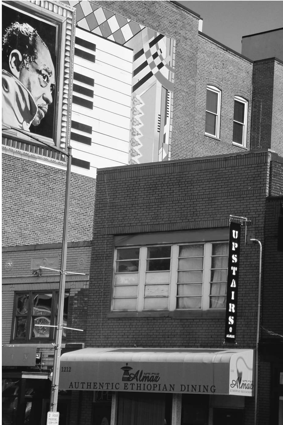
PLATE 6.1 On U Street NW in Washington, DC, a mural of Duke Ellington overlooked Almaz, an Ethiopian restaurant that closed during the pandemic in 2020.