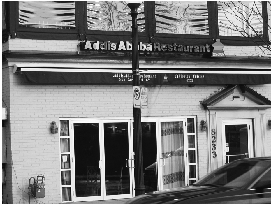
PLATE 6.3 Addis Ababa Restaurant in Silver Spring, Maryland (named after the Ethiopian capital city), was one of dozens of Ethiopian restaurants scattered across the DC metropolitan area.

that recall places in the owner's native region of Ethiopia or Eritrea, such as Langano (a lake in Oromia south of the Ethiopian capital), Ras Dashen (the highest mountain in northern Ethiopia's Semien Mountains), Dukem (a small town south of Addis Ababa), or Lalibela (site of the famous rock churches in northern Ethiopia). Certain city names (Asmara, Dire Dawa) signal owners and clientele of Eritrean or Oromo ethnicity, respectively. (See plate 6.3.) Many restaurants use Ethiopian words evoking moods, important dates, and objects: Desta (joy or happiness), Meskerem (September, start of the new year), and Kokeb (star). A few take the name of their owners, such as Zenebech or Rahel. Others are named after Ethiopian Christian holidays and important rituals, or objects associated with food and its presentation, including Fasika (Easter), Demera (ritual bonfire for Masqal ), Bunna (coffee), and Mesob (large table-height basket that holds a communal food tray). An informal commentary about Ethiopian restaurants in a cross section of American locales provides a colorful overview: