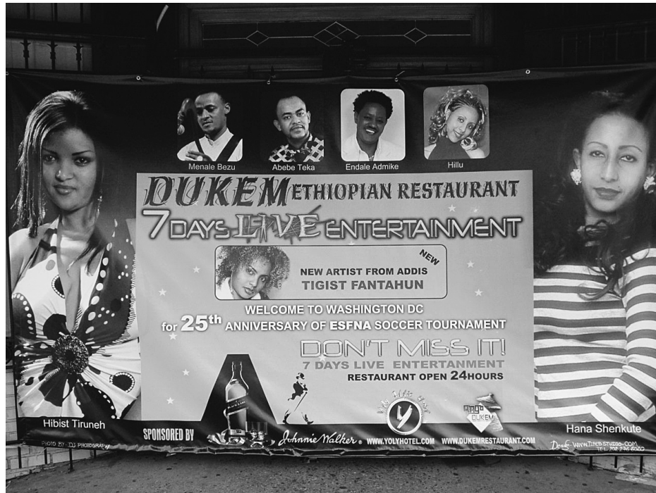
PLATE 6.7 A banner announcing 24/7 musical entertainment at Dukem Ethiopian Restaurant, Washington, DC, during ESFNA 2008.

Eritrean and Oromo games both scheduled for dates that do not conflict with ESFNA. But in 2011–12, homeland political conflicts divided ESFNA and led to a split that resulted in a competing tournament. The annual ESFNA soccer tournament took place in Dallas, Texas, from July 1 to 7, 2012, and a rival tournament was mounted by the newly organized All Ethiopian Sports Association One (AESAOONE) during that same week in Washington, DC. 49 The soccer tournaments bring the sāmanna wärq (wax and gold) metaphor to life—what appears on the surface to be merely a sports event on closer scrutiny reveals multiple layers of athletic, musical, and political competition.