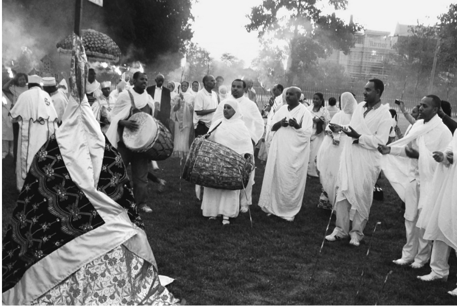
PLATE 6.5 New Riverside Park in Cambridge, Massachusetts, is an ethnic arena regularly transformed for community Masqal observance.

Oakland Ethiopian community when he arrived there in 1975. 40 “Since it was a small community, this was our chance to get together and speak our national language.” 41