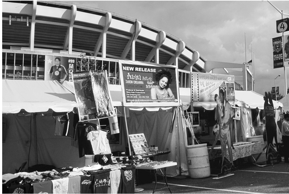
PLATE 6.6 The ESFNA 2008 sociocommerscape constructed alongside RFK Stadium in Washington, DC.

to bring these new communities together. (See table 6.2.) Major musical events both open and close the games: An opening “Ethiopia Day” concert typically leads off the tournament, and a festive concert with major performers is scheduled for the final evening. 44