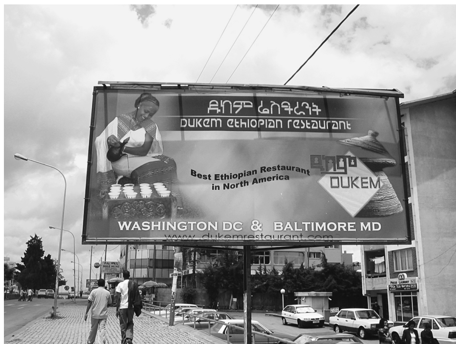
PLATE 6.4 Billboard on Bole Road in Addis Ababa advertising Dukem Ethiopian Restaurant in Washington, DC, and Baltimore, Maryland. Collection of author.

communities in such arenas are heavily associated with musical performance.