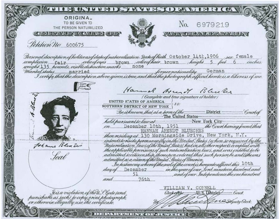
Figure 1. Hannah Arendt's US Certificate of Naturalization, December 10, 1951. Hannah Arendt Papers, Manuscript Division, Library of Congress, Washington, DC.

undemocratic tendencies in American culture and politics. Arendt's lament over the failures of literature must be seen in relation to the promise she made when she became a naturalized foreigner.