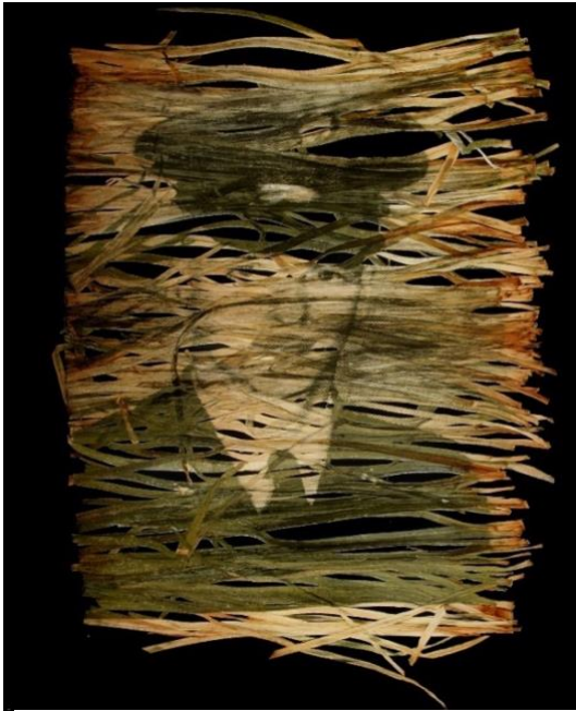
Figure 5 (on left). Edison R. Phillips, 19 years old, 2008. Binh Danh, Life: One's Week Dead Series . Chlorophyll print on grass and resin. Frame: 18 1/8 x 15 1/16 x 1 3/8 inches. (courtesy of the artist)