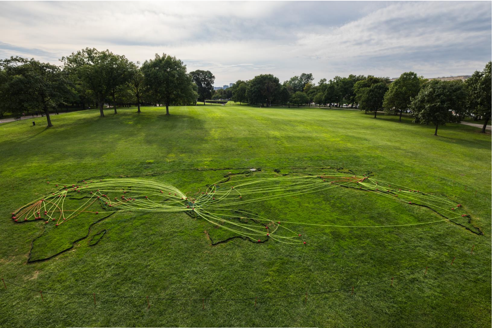
Figure 4. Tiffany Chung, For the Living (2023). Mixed media earthwork representing the global routes of Southeast Asian refugees displaced by the Vietnam War, adjacent to the Vietnam Veterans Memorial.

In September 2023, I (Heidi) went to the National Mall to visit the Vietnam Veterans Memorial and the adjacent temporary installation, For the Living , by Vietnamese American artist Tiffany Chung (see Fig. 4). 29 Chung's memorial, against the permanence of the monuments and memorials on the National Mall, was designed to be temporary and portable in accordance with the schedule of the Beyond Granite outdoor exhibit, which was only permitted to take place from August to September 2023. 30 Visitors to the National Mall were sparse on that Sunday, and the few visitors to the wall me-