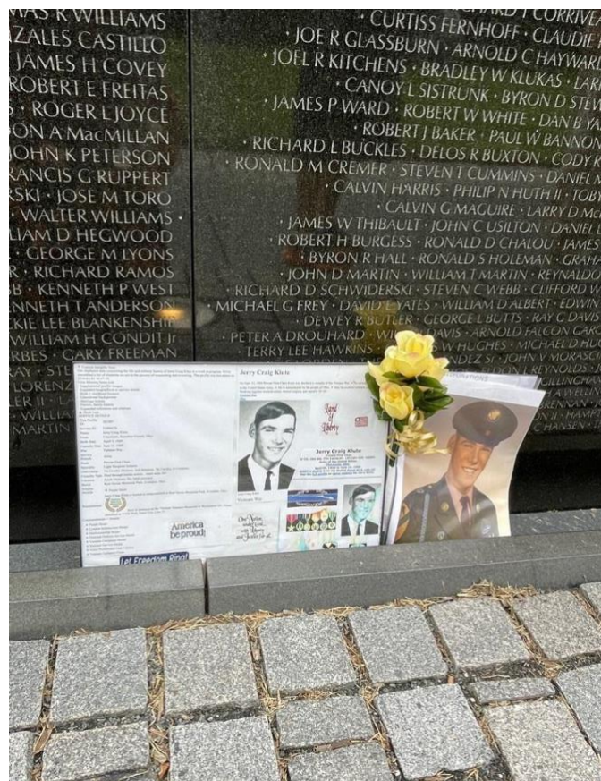
Figure 7. Headshots and other items of tribute at the Vietnam Veterans Memorial in Washington, DC.