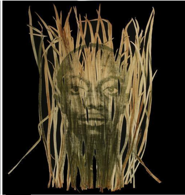
Figure 6 (on right). Gary McCollough, 20 years old, 2008. Binh Danh, Life: One's Week Dead Series . Chlorophyll print on grass and resin. Frame: 18 1/8 x 15 1/16 x 1 3/8 inches.

Vietnamese American artist Binh Danh is most known for innovating the development of “chlorophyll prints” as a method of engaging a collective memory of the Vietnam War, utilizing photosynthesis to record and imprint iconic images of war onto the foliage of plants. After placing positives of photographs onto leaves or grass—often photographs that, rather than of his own taking, draw from iconic images of the war within an American national consciousness—Danh covers the piece with glass and leaves it exposed to sunlight over several days, allowing the image to materialize on the surface of the leaf. A process of trial and experimentation, Danh engages in this process multiple times before achieving desired results, when he preserves the leaf in resin. Danh’s innovative method of chlorophyll printing exemplifies what environmental media scholar Melody Jue describes as “metabolic photography,” or “the development of images through the vital processes of photosynthesis” that allow plants to participate in the creation of the image “not only as represented figures, but as metabolic agents.” 41 Chlorophyll printing relies not on traditional artistic methods of chemical processes or ink, but on varying levels of sunlight in the natural world; the plant life itself—leaves and grass often found from Danh’s mother’s garden in