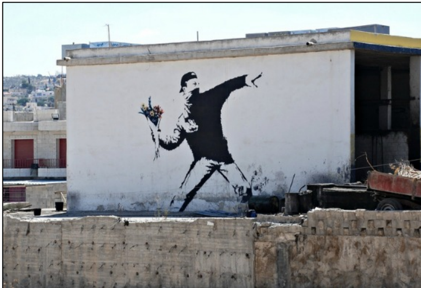
Figure 5. Street art in Bethlehem, by Banksy, 2004.

In both cases, street art emphasizes “the mobility of signs across time and space, combined with a strong sense of the local” (Blommaert, 2010, p. 22). Locality creates here a very different meaning and effect, due to practices that are not only local and social but also historical. For example, we can observe that further historical layers were added to the original street art: the layer of long history (War of Independence) - connected to the national frame of time and space - dramatically affects the layer of recent history (European debt crisis). In sum, similar representations found in Bethlehem and Athens were produced as a result of different social and historical processes in different places and at different times.