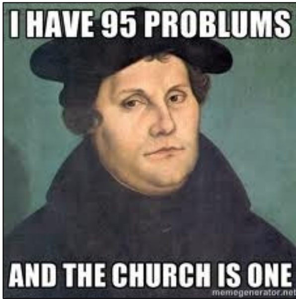
Figure 1. Martin Luther “99 Problems”. Google Images, downloaded February 28, 2015.