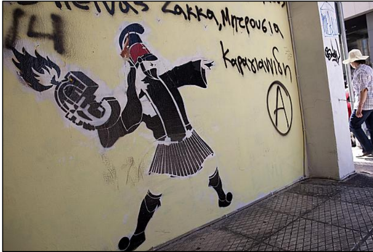
Figure 4. Street art in Exarchia, Athens.