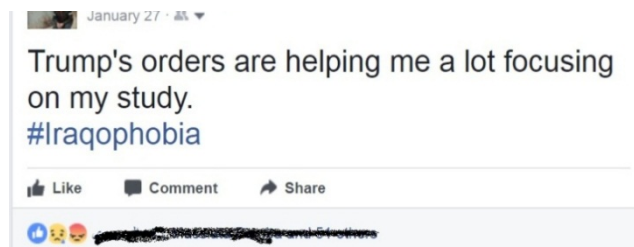
Figure 1. Reaction to Trump's executive order to ban Muslims

During my first year in the PhD program, in January of 2017, the president of the United States, Donald Trump, had issued his executive order banning Muslims from entering the US, specifically from seven countries, one of them being Iraq. Although these orders were rejected by many Americans and were overturned by the courts, I could not stop thinking of myself and my family as marginalized and threatened. During that week, I became convinced that I might not be able to continue living in the US. My public reaction to these presidential orders was represented by two Facebook posts ( Figures 1 and 2 below). In Figure 1 , I was being sarcastic as a way to show how those new orders had directly influenced my study and my status as a student, as if they were tailored for me and my Iraqi Muslim family.