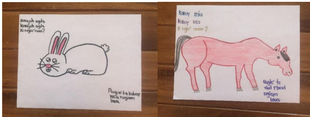
Figure 2: Two sequential pages from the student-created book (Images, 2018), with the text “White rabbit, white rabbit, what do you see? I see a red horse looking at me” (left) and “Red horse, red horse, what do you see? I see a purple cat looking at me.” (right).

The final method that we piloted is student-generated books in Zapotec. In this case, I read the book Oso pardo, oso pardo, ¿qué ves ahí? ('Brown bear, brown bear, what do you see?' by Martin & Carl, 2002) in Spanish. The book is repetitive, going through a number of animals of different colors and asking what those animals see. After reading the book, we worked together to translate the book to Zapotec. Each child was invited to choose their own animal and color and to illustrate it and add the relevant text in Zapotec. To link the pages together, the students chose the order that the pages would be presented in (Figure 2). The orthographies that students used were a combination of the community language committee orthography (which I used when presenting written materials in the class) and the students' individual choices in writing the language. I did not 'correct' any writing choices, as the presence of more than one proposed orthography in the community makes it difficult to say what the 'standard' spelling of any word should be. Furthermore, I did not want to discourage students' enthusiasm and independence by correcting their work; I instead encouraged students to read to me what they had written to make sure that they could read their own writing. However, I used the community language committee orthography when students asked me for assistance with spelling.