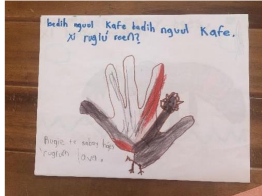
Figure 3: Image of a brown turkey from a student-created book (Images, 2018), with the text “Brown turkey, brown turkey, what do you see? I see a black horse looking at me.”

product. Furthermore, students were proud of the work they had done; they asked to read the book on subsequent days of class and quoted lines from the book when asked in the interviews what they enjoyed about the course. The text was also linked to a task-based activity completed later in the course when students took a hike with friends and family while collecting information about local flora and fauna by asking each other, “What do you see?”