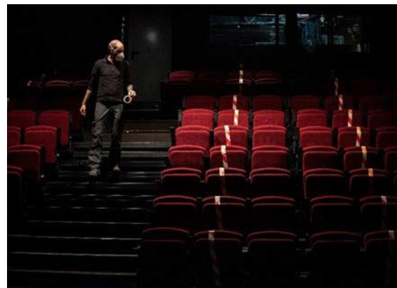
Figure 2. Preparing the auditorium to comply with regulations. Teatro del Barrio (Lavapiés, Madrid), February 2021.