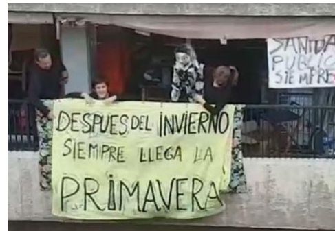
Figure 4. Final moments of the performance, Valencia, March 2020.

Learners discussed how sound, image and movement conveyed dramatic meaning in the distance, and explored contextual possibilities, that is, what the location signified, the message in the banners, the impact of this performance (meaning and context, community creation) and how it had creatively made the most of limited resources.