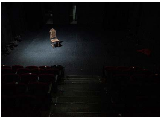
Figure 1. Ghost light on an empty stage. Teatro del Barrio (Lavapiés, Madrid), February 2021. 11

First, to introduce students into the Spanish context where distanced drama had emerged and eke out the role of theatre in society, the cultural researcher guided a group analysis of images by Spanish photographer Fernando Sánchez (Figures 1 and 2) depicting different views of a local theatre during the pandemic.