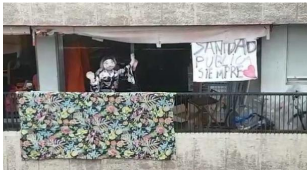
Figure 3. Odet desde el balcón, puppet performance, Valencia, March 2020. 15

The second day, still moderated by the cultural researcher, focused on exploring resources traditionally used in theatre to connect with audiences such as analyzing images from plays where meaning was conveyed through posture and dress, the storytelling strategies deployed by performers during the pandemic, and analyzing a performance by Anna Albaladejo (Figures 3 & 4). 14