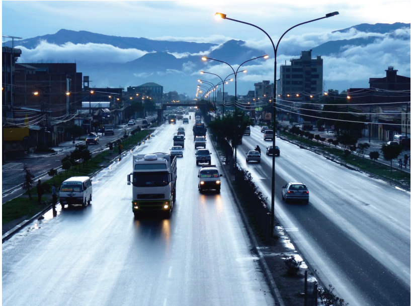
Avenida Blanco Galindo, Cochabamba.

In January, urban and rural communities coordinated their efforts in the first of several nationwide blockades. Unions took charge of six bridges across the Rocha River into downtown Cochabamba, the Regantes maintained control