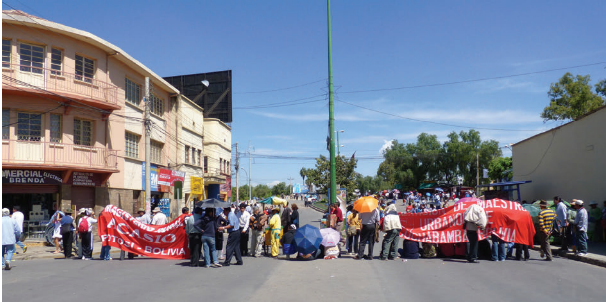
Rural and Urban Teachers' Unions divide the work of blocking Heroínas Avenue near downtown Cochabamba in April 2011.