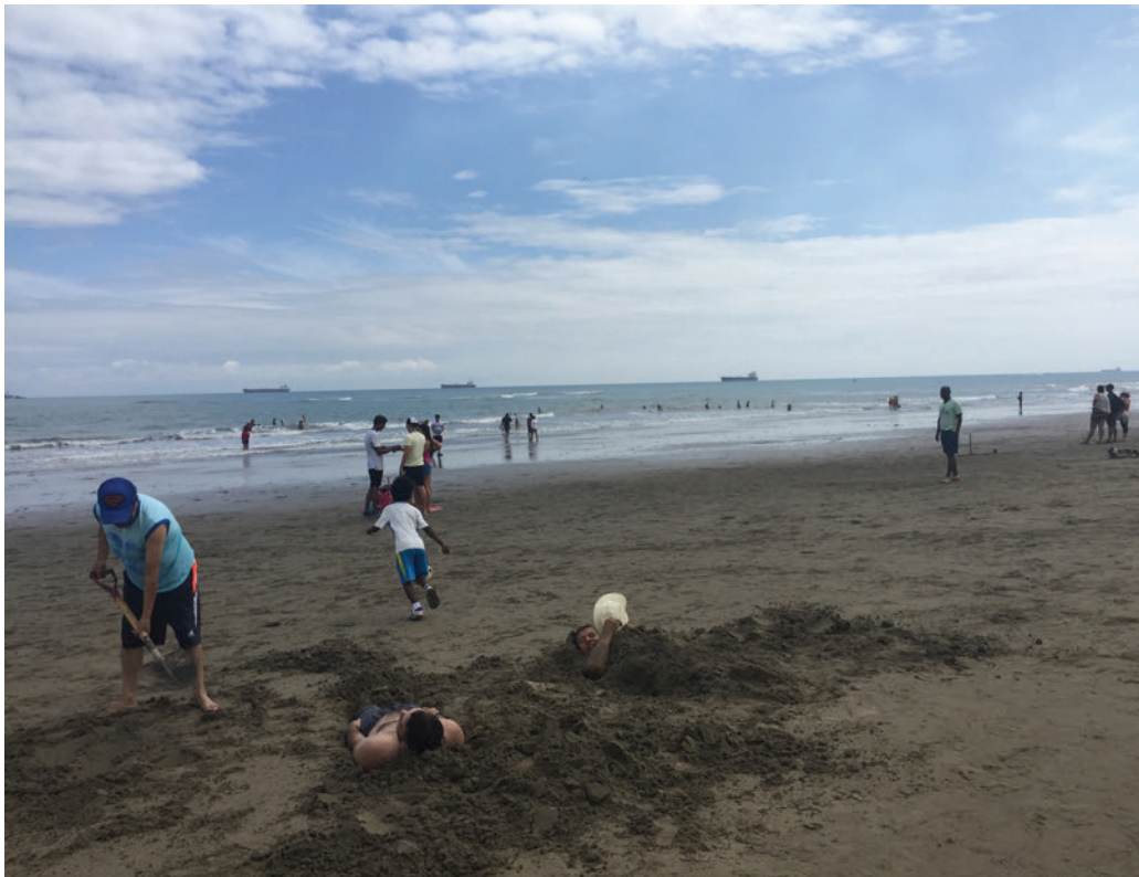
Oil tankers are an ordinary sight at Esmeraldas Beach, one of the city's premier tourism spots and the focus of urban development under the Correa administration.

In the scientific world, viscosity is a measure of the internal resistance of a fluid to flow. Here, the concept of viscosity signals two things. First, viscosity is a methodological demand to