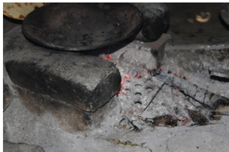
FIG. 2. The Mewar Angithi, a simple metal grate insert, is designed to improve airflow to flames to improve combustion efficiency and reduce wood usage, cooking times, and particulate emissions.

Based on the principle that efficient combustion produces less smoke, they designed the Mewar Angithi (Figure 2), a simple steel grate insert into existing chulhas (Udaykumar et al. 2015). Named after the region of Mewar where it originated, the insert improves airflow by creating a channel between the stove floor and firewood. This separates ash buildup that can smother unburned wood and catches larger embers,