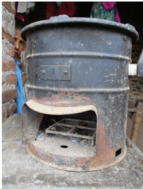
FIG 1. This high-efficiency cookstove manufactured by Envirofit increases cooking efficiency but requires smaller diameter fuelwood, causes certain foods to cook unevenly or burn, and exposes children and cooks to burn risks. Spider webs and dust seen in the side view indicate this family has decided not to continue using this stove.

The smokeless chulhas reduce smoke inhalation by redirecting smoke out of a house through a chimney. In the early 1980s the Indian government funded training programs to construct and use one such smokeless chulha, the “Nada Stove,” designed by Madhu Sarin and her Haryana village partners. The training programs, though ambitious in number, lacked sufficient resources and resulted in chulhas that were too tall, pot openings that were too small, and chimneys that didn’t provide adequate draft to make the stove function properly. In addition, the introduction of chimneys in communities with thatched roofs introduced