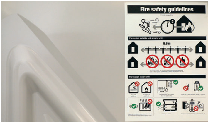
“...a fire safety test on the IKEA shelter.”

The fire tests raised a number of questions. Is this a “slightly” Better Shelter? Or is it “sometimes” a better shelter, depending on location and context? And when , exactly, is it a better shelter – in which times and