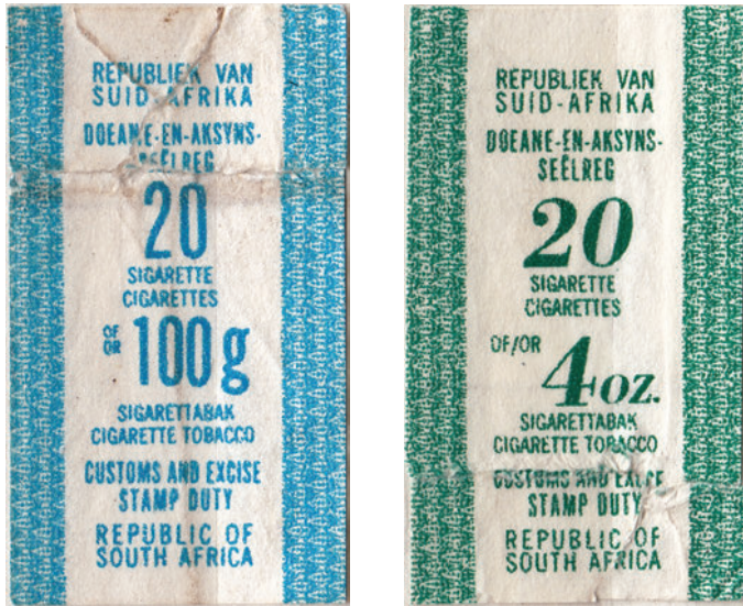
FIG 2. Tax revenue stamp from South Africa.

present-oriented” and/or had experienced “unhappy” and “stressful events” (Becker and Murphy, 1988:694; Chaloupka 1990:737).