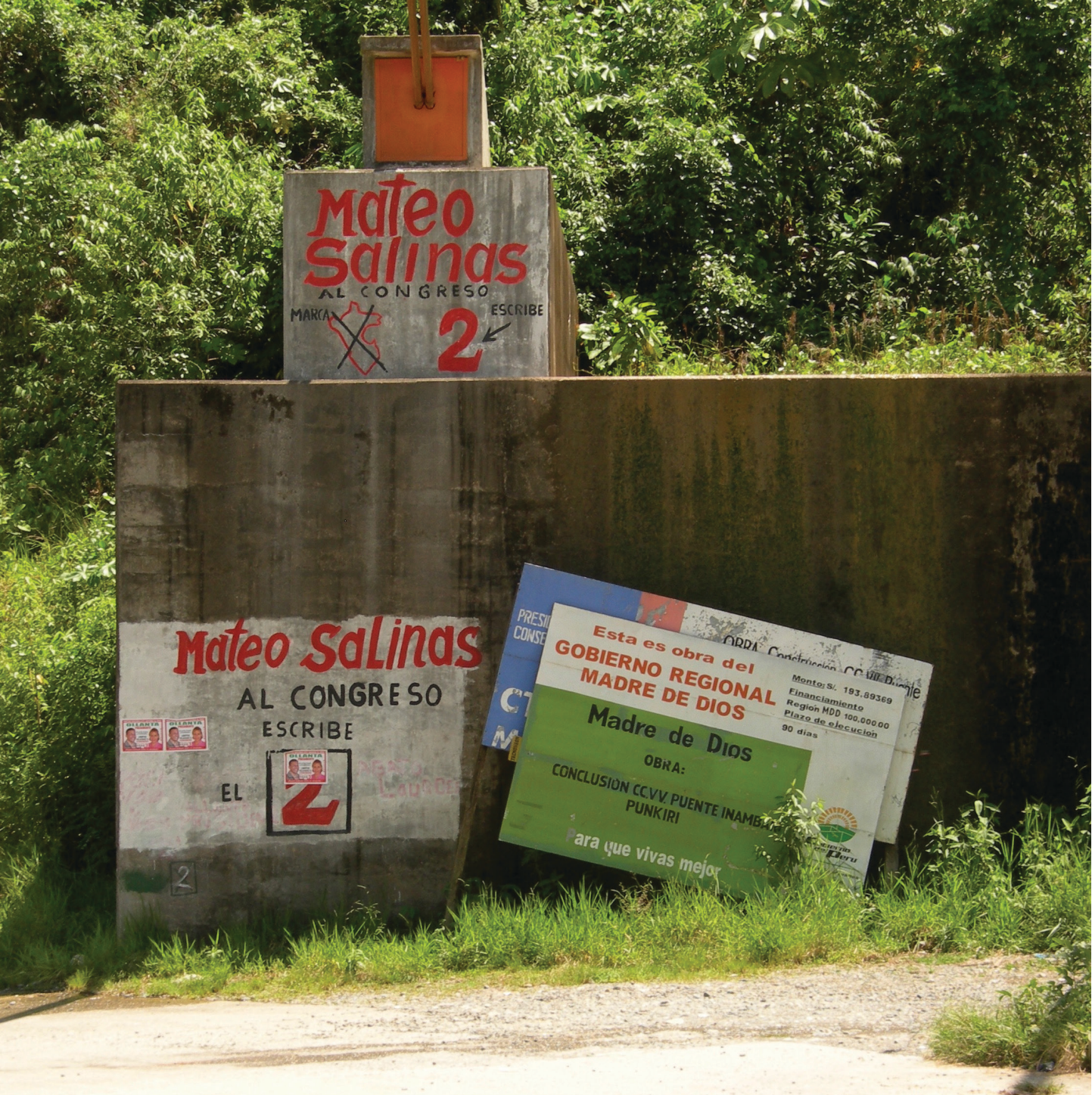
FIGURE 3: Public Appeals.

side of the flooded section of the highway, but surely it would undermine the flow of goods and people from Brazil upon which the whole cost-benefit analysis of the project had originally hinged. The contradictions in turn make it abundantly clear that there never was a single or coherent public that stood to benefit from the road construction project, or who might in turn be served by the dam. In the planning stages of infrastructural projects, beneficiaries are identified and enumerated as justification for