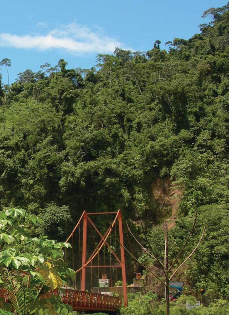
FIGURE 1. The Inambari Bridge, where the Interoceanic Highway crosses the River Inambari.