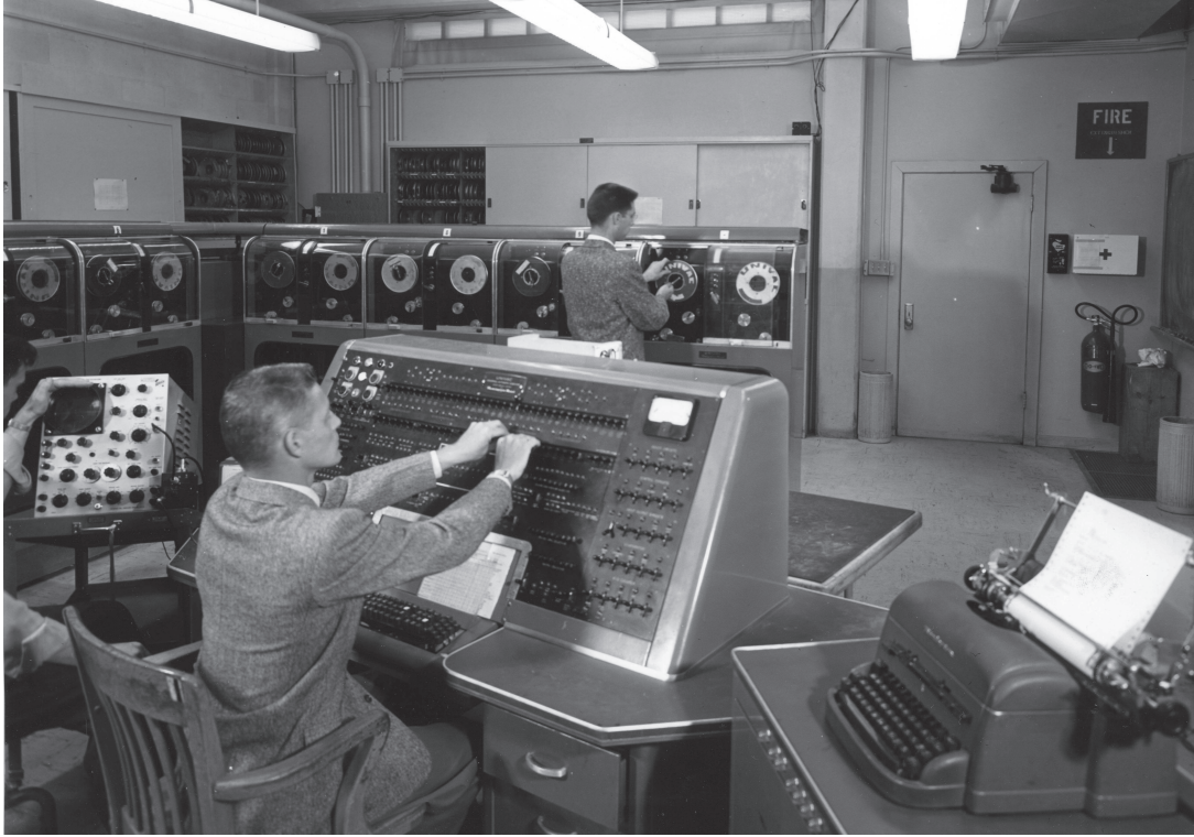
FIGURE 5. UNIVAC, one of the computers used in the analysis of strategic vulnerability.

infrastructures, food systems, and public utilities that met civilian needs.