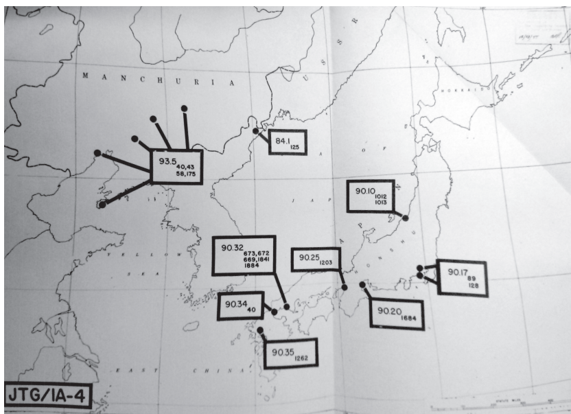
FIGURE 3. In the latter stages of World War II, the Joint Target Group produced maps and target lists based on their analyses of critical vulnerabilities in the Japanese military-industrial economy. This target map focuses on Japanese oil production as a potential target system. It is notable that some of the facilities identified on the map are located in Japanese-occupied parts of China. Though this target system was vital to the Japanese military-industrial production apparatus, it extended beyond Japanese territory. (JOINT TARGET GROUP 1944)

Recalling the experience of the JTG during World War II, Lowe noted that information about the Japanese industrial economy had not been hidden or secret. Rather, it was “open intelligence—facts about industry, location of plants, machinery that is in them, the materials that