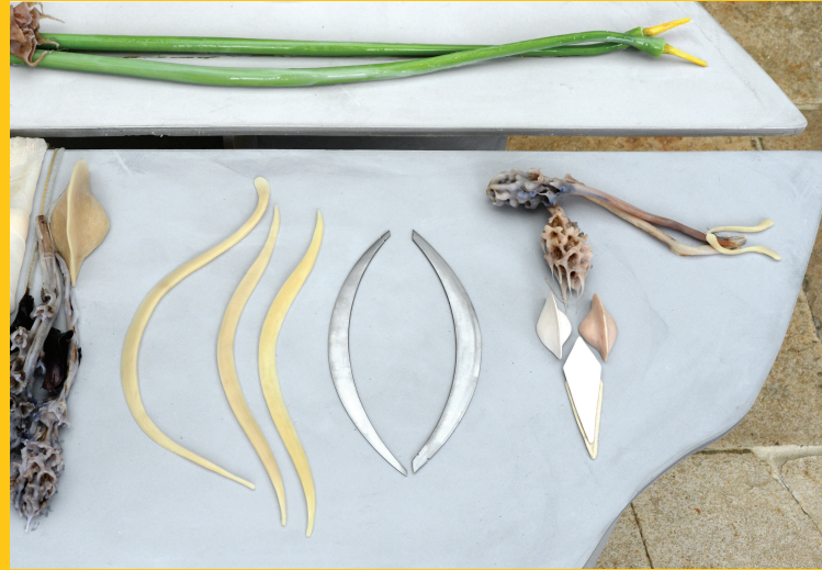
FIG. 5: Miriam Austin, Prosthetics for Hostile Contexts (detail).