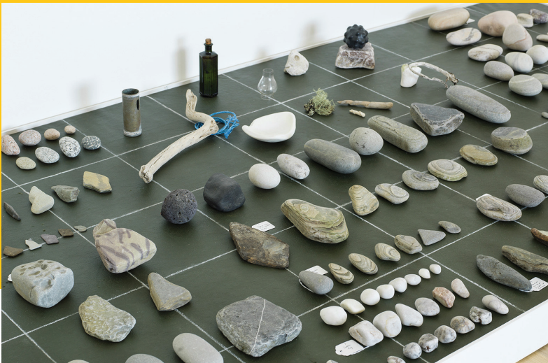
FIG. 7: Anna Hughes, Looped Among Islands (detail).