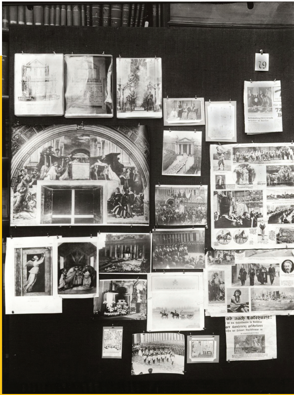
FIG. 1: THE ARTWORK AS DOCUMENT. Panel from Aby Warburg's Mnemosyne Atlas , an unfinished, thematic and aggressively anachronistic art historical project, now reconstructed in a fascinating website hosted by Cornell University.