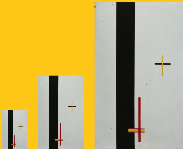
FIG. 2: THE ARTWORK AS INFORMATION. Laszlo Moholy-Nagy, Constructions in Enamel I, II and III , 1923. Identical works at different scales, purportedly made by an enamel factory which had received the specifications over the telephone.