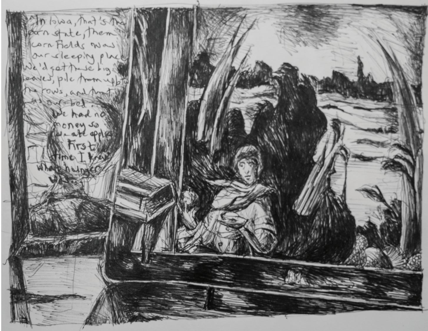
ABOVE: "corn fields was our sleeping place..." (Case No. 9, Wisconsin, Microcard Publications of Primary Records in Culture and Personality 1956). DRAWING BY THE AUTHOR.

success, the device did not flourish; that first version was also the last. In a long tradition of imaginary machines, it remained, for some time, difficult to locate. Instead, the archive's chosen format and pre-existing methodological and theoretical frameworks became obsolete, so that the data itself did not so much disappear as lapse into abeyance, latency, irrelevance. (Note that although the original READEx reading machines for opaque micro-formats themselves gradually became obsolete, next-generation analog machines and finally the ST200X Series Digital Film Viewer allowed me to access the data when I began my research around 2007.)