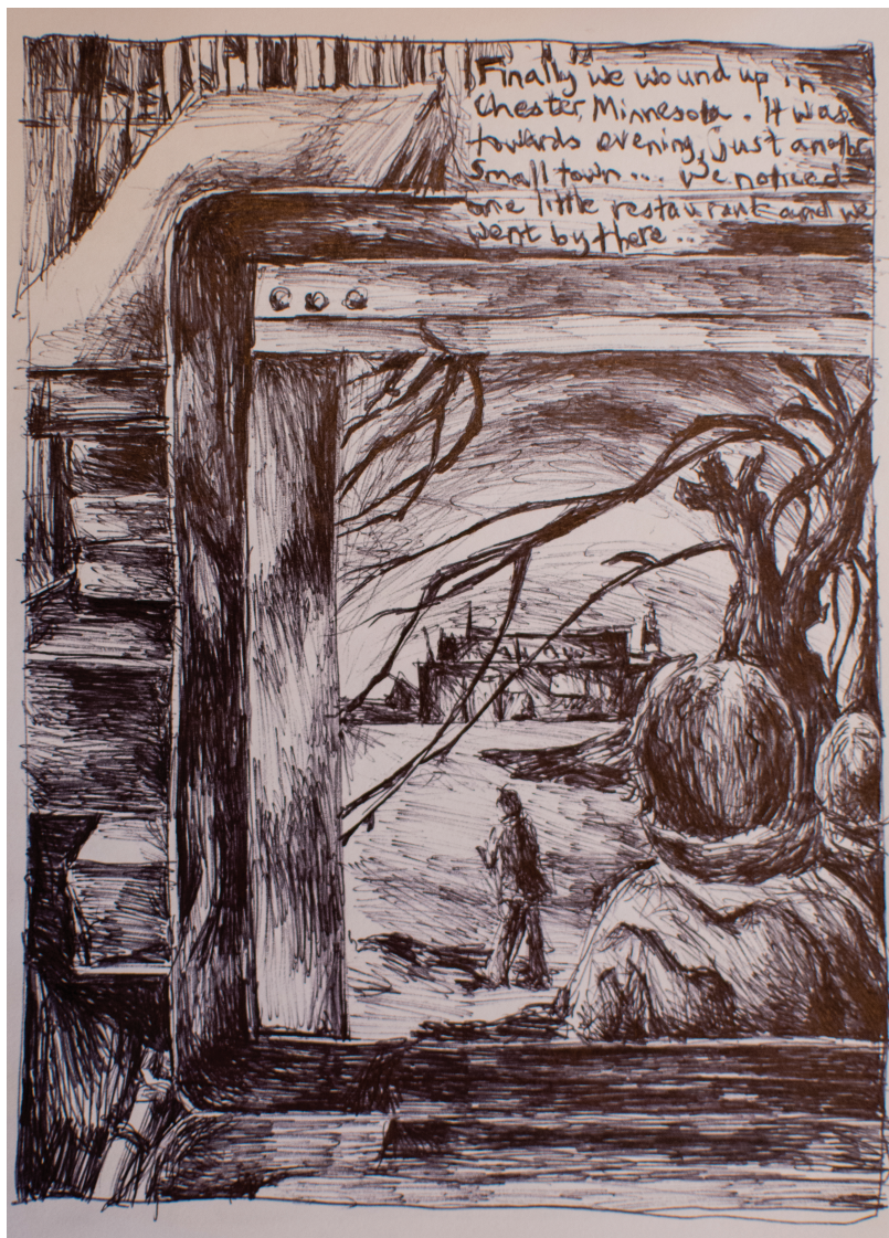
ABOVE: "Finally, we wound up in Chester, Minnesota..."