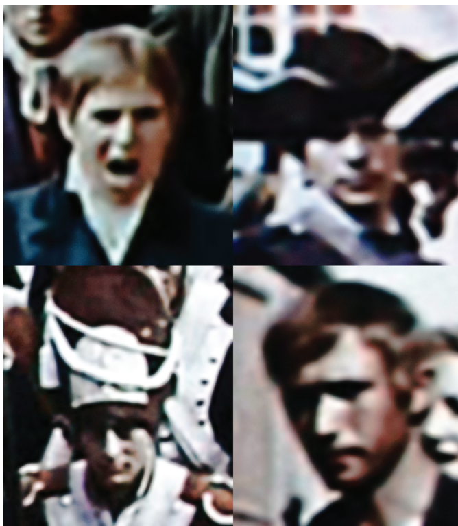
LEFT: From “Clichés VII (2nd Vertical/Horizontal Group),” in “Clichés,” Residua . ABOVE: From “Likenesses,” I-IV, in “Démontage,” Forensics .