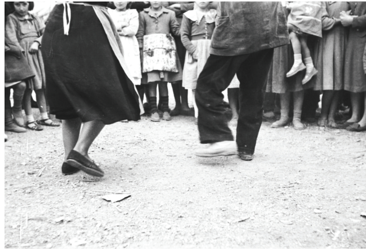
Sevillana dancers in town square.

television, it is unlikely that they ever made it back to their communities of origin. Though Lomax saw Choreometrics as an interactive medium, a cybernetic system in a world of unidirectional broadcast TV, the final product ended up far more conventional.