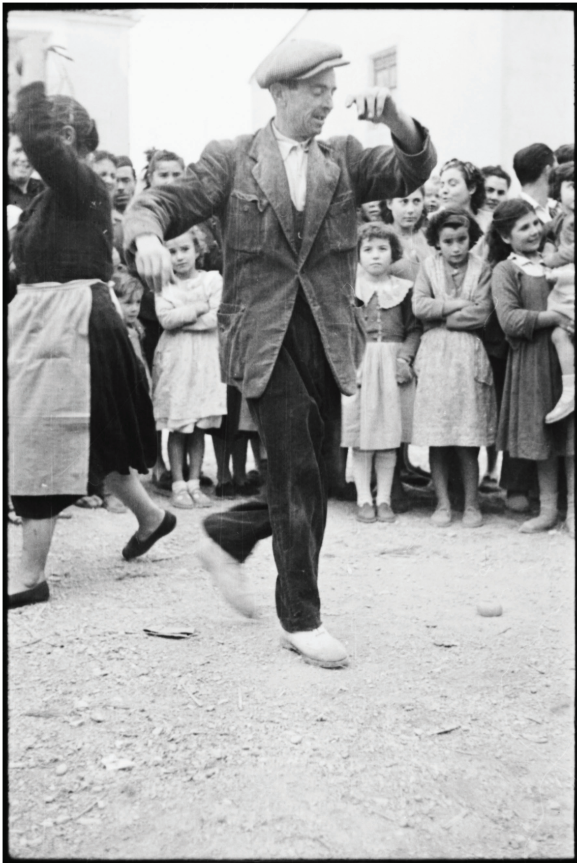
"Sevillana dancers in town square,"