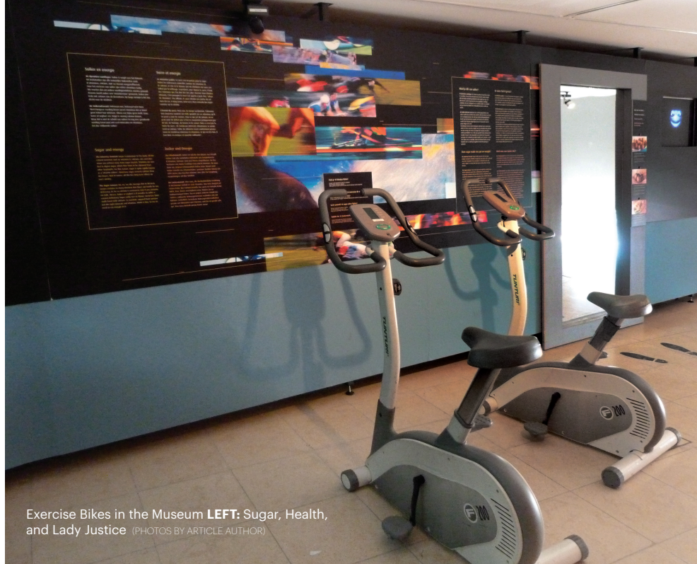
Exercise Bikes in the Museum LEFT: Sugar, Health, and Lady Justice

workers within a broader geographic region. Sugar has tied people together through local festivities, right up to today's Sugar Rock festival, which is sponsored by the factory. But as soon as we approach sugar itself , strange things happen. Our social ties with sugar are cut. First of all, sugar becomes a matter of science : not just chemistry, but sacred chemistry that we should not meddle with. Second, when we touch upon the question of sugar's health risks, our sweet molecule is not allowed to partake in social life either. When asked to make a judgement in front of an exercise bike, one may wonder what happened to all the human, technical, and political resources necessary to make sugar's existence possible and virtually omnipresent in packaged food products.