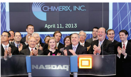
Chimerix rings the bell at NASDAQ.

BRINCIDOFOVIR IS A "PRODRUG," a weakened form of the antiviral cidofovir. It becomes fully active only when human