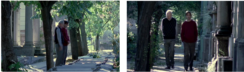
Father and son visit the cemetery

of his orphaned state and into adulthood, like the path they walk on, is straightforward: enter the family business. A position at Fernández Propiedades is not only Gastón's birthright; it is also a means of becoming an adult member of the family. This choice between growing up or remaining in a state of arrested development comes to a head when Gastón visits his father at the office to ask for a loan.