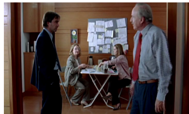
From slacker to businessman

Gastón’s father not only thrives within Chile’s hierarchical economy; he also puts this economic model into practice by cultivating his own son as the company’s heir. The elder Fernández confirms his nepotistic intentions when Gastón, wearing a suit, shows up to