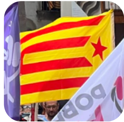
Fig. 3. The estelada vermella , carried during the ANC’s 2022 Diada march.

Another variation of the estelada , known as the estelada vermella (red estelada , see fig. 3), was developed by the Socialist Party of National Liberation (PSAN) in 1968. The colors of the star and triangle were changed to red and yellow, respectively, in order to highlight the radical leftist character of the party and the flag (Albertí 254). Since the fall of the Soviet Union, the estelada vermella has lost most of this leftist symbolism and now simply represents another version of the traditional estelada (Albertí 256). Still other variations of the estelada exist, such as the estelada blaugrana (blue and maroon estelada ) seen in fig. 4, which displays the colors of the FC Barcelona football club.