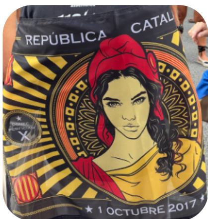
Fig. 13. República catalana flag.

The latin motto “ Donec perficiam ” (Until I succeed) was also present throughout the LL. This phrase was the motto of the Catalan Royal Guard during the War of Spanish Succession, and similarly conveys the bandera negra ’s message of no surrender. Fig. 13 shows this message incorporated into the República Catalana flag. This new flag has senyeres in the four corners of its design and proclaims that the Catalan Republic was founded on the date of the independence referendum (October 1st, 2017). “ Donec Perficiam ”, shown in detail in fig. 14, appears on this flag surrounded by the design of the bandera negra (an independence star and the cross of Santa Eulàlia ). Fig. 15 shows a fusion of the bandera negra and the República catalana flag. The incorporation of the senyera , the bandera negra , and the star of the estelada into the new República Catalana flag shows the importance of honoring past heraldic emblems in modern semiotic displays of support for Independence . The senyera in particular serves as a reminder that the existence of a unique Catalan identity and nation, separate from Spain, is a principal motivator in the Independence struggle.