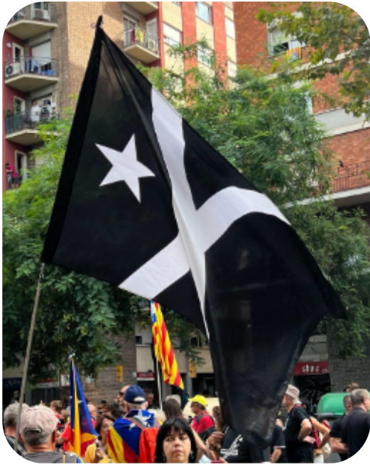
Fig. 5. The bandera negra , carried during the ANC's 2022 Diada march.

The designers thus achieved a synthesis of the historical importance of 1714 and the Catalan independence project. In this way, the bandera negra further highlights the importance of Catalan folklore and cultural elements in their heraldry.