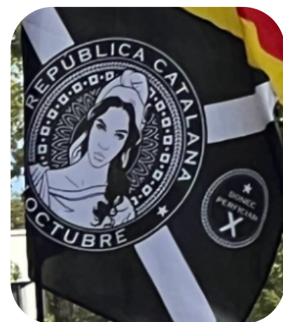
Fig. 15. Fusion of the bandera negra and the República catalana flag.

The presence of a woman on the República catalana flag is also noteworthy. Some Independence messages appeared alongside messages of support for Feminism (see, e.g., figs. 16 and 17). Both artifacts incorporate an estelada 6 indicating that part of the platform for promoting an independent Catalan Republic involves greater support for women’s equality. Additionally, a star, whose semiotic link to Independence was established with the creation of the estelada , appears at the bottom of fig. 16 and inside the female gender symbol in fig. 17. A chromatic semiotic element in fig. 17 is the use of the color purple, the color of women’s equality. Over a third of the artifacts that include Feminist thematic content incorporate the color purple, and 100% of the artifacts that have Feminism as their exclusive thematic focus do so. The use of purple is significantly higher in Feminist artifacts than in artifacts related to other themes ( p < .0001 ). The conflict between borders and identity also appears in