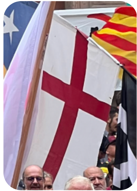
Fig. 6. The creu de Sant Jordi , carried during the ANC's 2022 Diada march.

Finally, the creu de Sant Jordi or Saint George's cross (see fig. 6) was the official coat of arms for the Generalitat de Catalunya from its founding in the 14th century until 1714 (Albertí 57). It has always been a distinctive emblem for Barcelona, and remains a part of Barcelona's flag to this day. Though Sant Jordi is a figure of great importance in Catalonia, the flag bearing his cross did not evolve into a greater symbol of Catalan identity like the senyera because "historically, it became accredited only for the city of Barcelona" (Albertí 76, author's translation). Its relative frequency in this study's sample was small (N = 10), but its continued presence in la Diada speaks to its significance.