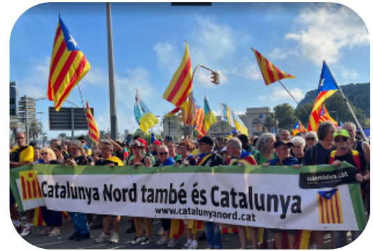
Fig. 22. “Catalunya Nord també és Catalunya” (Northern Catalonia is also Catalonia) with estelades and Intersindical Canaria flags in the background.

The third most frequent theme is Solidarity . Sympathetic compatriots from other Spanish autonomous communities who also have secessionist aspirations joined in la Diada celebrations, with their own heraldic imagery on full display. Such was the case for the Intersindical Canaria , an organization that advocates for independence of the Canary Islands from Spain. Their flags were accompanied by T-shirts proclaiming “ Autodeterminación ” (Self-determination), with the Intersindical Canaria flag and the estelada vermella joined in a heart (detail seen in fig. 21). Heraldic emblems were also present from the Basque Country and Biafra, where there are also secession movements. La Diada participants from Northern Catalonia (the Catalan-speaking region of France), the LGBT+ community, and various neighborhoods and cities of the Barcelona Metropolitan Area also showed Solidarity with Catalonia’s cause (see, e.g., figs. 22 and 23). Fig. 22 demonstrates how Catalan identity is not contained within Catalonia’s borders.