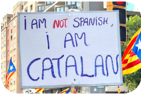
Fig. 30. “I am not Spanish, I am Catalan”.