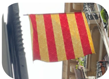
Fig. 1. The senyera , hung from a balcony in La Ciutat Vella , Barcelona’s old town.

Important heraldic emblems are commonly used to manifest Catalan identity and secessionist sentiment. The earliest of these is the senyera (see fig. 1), known as the flag of the Catalan nation and culture, “the most pre-eminent of Catalan symbols” (Cattini 448), and a key emblem of Catalan identity (Anguera, Les Quatre Barres back cover).