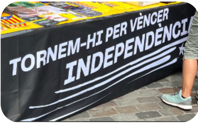
Fig. 12. Banner, “ Tornem-hi per vèncer: Independència ” (Let’s come back to win: Independence).

The latin motto “ Donec perficiam ” (Until I succeed) was also present throughout the LL. This phrase was the motto of the Catalan Royal Guard during the War of Spanish Succession, and similarly conveys the bandera negra ’s message of no surrender. Fig. 13 shows this message incorporated into the República Catalana flag. This new flag has senyeres in the four corners of its design and proclaims that the Catalan Republic was founded on the date of the independence referendum (October 1st, 2017). “ Donec Perficiam ”, shown in detail in fig. 14, appears on this flag surrounded by the design of the bandera negra (an independence star and the cross of Santa Eulàlia ). Fig. 15 shows a fusion of the bandera negra and the República catalana flag. The incorporation of the senyera , the bandera negra , and the star of the estelada into the new República Catalana flag shows the importance of honoring past heraldic emblems in modern semiotic displays of support for Independence . The senyera in particular serves as a reminder that the existence of a unique Catalan identity and nation, separate from Spain, is a principal motivator in the Independence struggle.