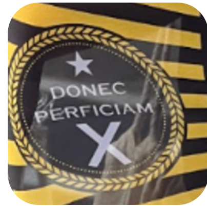
Fig. 14. Detail of “ Donec perficiam ” (Until I succeed) from the República catalana flag.