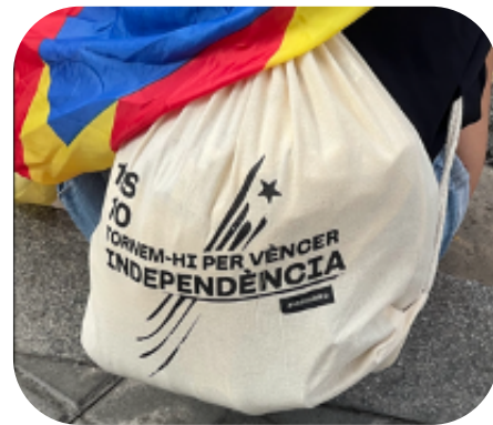
Fig. 10. Bag, “ Tornem-hi per vèncer: Independència ” (Let’s come back to win: Independence).

Regarding the thematic analysis, Table 6 shows that the ongoing fight for Independence was the most dominant theme. The ANC’s official motto for the 2022 Diada was “ Tornem-hi per vèncer: Independència ”. (Let’s come back to win: Independence). This motto appeared on banners, T-shirts, bags, stickers, and other merchandise (see figs. 10–12), and was accompanied by a white and black version of the estelada . Chromatically, official rally merchandise resembles the bandera negra , which further projects pro-independence sentiment and conveys the idea of fighting without compromise until Independence is achieved.