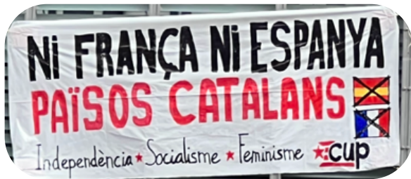
Fig. 16. “Ni França ni Espanya: Països Catalans. Independència, Socialisme, Feminisme” (Neither France nor Spain: Catalan Countries. Independence, Socialism, Feminism).

in fig. 16. Though the bulk of the Catalan Countries 7 lie within French and Spanish borders, Catalan national identity does not adhere to these borders.