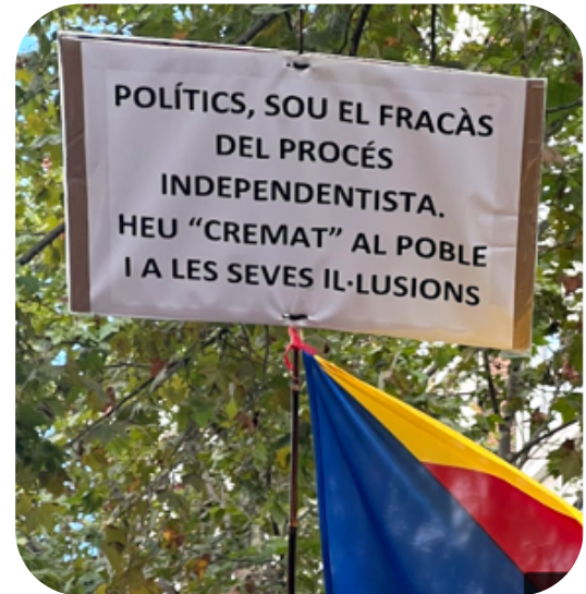
Fig. 18. “Polítics, sou el fracàs del procés independentista. Heu ‘cremat’ [e]l poble i les seves il·lusions” (Politicians, you are the failure of the independence process. You have burned the populace and their dreams) atop an estelada .

royal family, who were fighting against the Principality of Catalonia during the war (Cattini 451) and remain on the Spanish throne to this day. The term has reemerged during el Procés as an insult against those who do not support independence. Therefore, its use to describe the leaders of the pro-independence parties is striking, and speaks to the high level of disillusionment among those in the populace who are partial to secession.