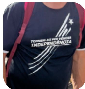
Fig. 11. T-Shirt, “ Tornem-hi per vèncer: Independència ” (Let’s come back to win: Independence).