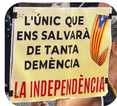
Fig. 24. “ L’únic que ens salvarà de tanta demència: La independència ” (The only thing that will save us from so much insanity: Independence), with an estelada .