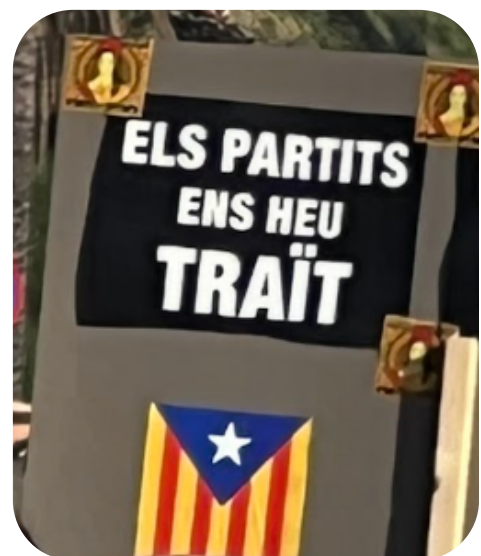
Fig. 19. “Els partits ens heu traït” (Political parties, you have betrayed us) with an estelada and República catalana flags.