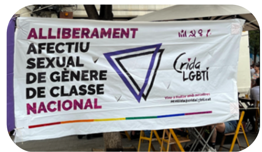
Fig. 23. “ Alliberament afectiu, sexual, de gènere, de classe, nacional. Crida LGBTI: Vine a lluitar amb nosaltres ” (Affective, sexual, gender, class, national liberation. Shout LGBTI: Come and fight with us) with an estelada at the top and the chromatic spectrum from the pride flag on bottom.

The third most frequent theme is Solidarity . Sympathetic compatriots from other Spanish autonomous communities who also have secessionist aspirations joined in la Diada celebrations, with their own heraldic imagery on full display. Such was the case for the Intersindical Canaria , an organization that advocates for independence of the Canary Islands from Spain. Their flags were accompanied by T-shirts proclaiming “ Autodeterminación ” (Self-determination), with the Intersindical Canaria flag and the estelada vermella joined in a heart (detail seen in fig. 21). Heraldic emblems were also present from the Basque Country and Biafra, where there are also secession movements. La Diada participants from Northern Catalonia (the Catalan-speaking region of France), the LGBT+ community, and various neighborhoods and cities of the Barcelona Metropolitan Area also showed Solidarity with Catalonia’s cause (see, e.g., figs. 22 and 23). Fig. 22 demonstrates how Catalan identity is not contained within Catalonia’s borders.