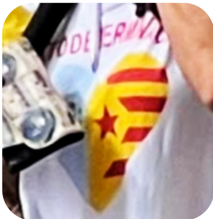
Fig. 21. “ Autodeterminación ” (Self-determination) with the Intersindical Canaria and estelada vermella flags joined in a heart.

In terms of the relationship between theme and heraldic imagery, Table 6 shows that whereas 91% of LL artifacts that incorporate independence-oriented heraldry express messages related to Independence , only 37% of written artifacts with senyeres pertain to this theme. Figs. 24–26 show examples of estelada variations in Independence signage.