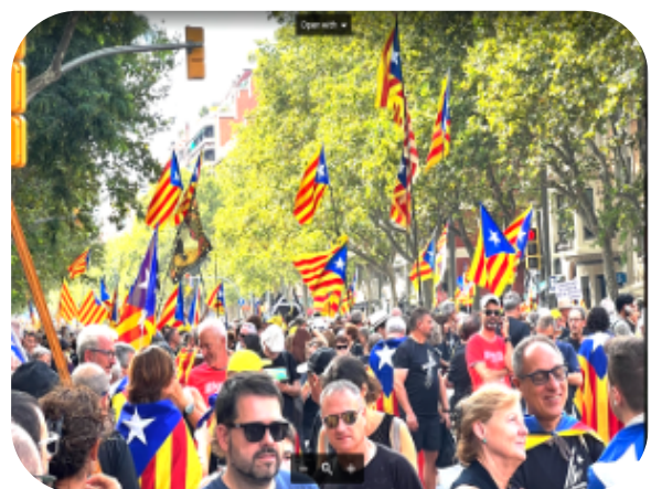
Fig. 8. A sea of estelades , la Diada 2022