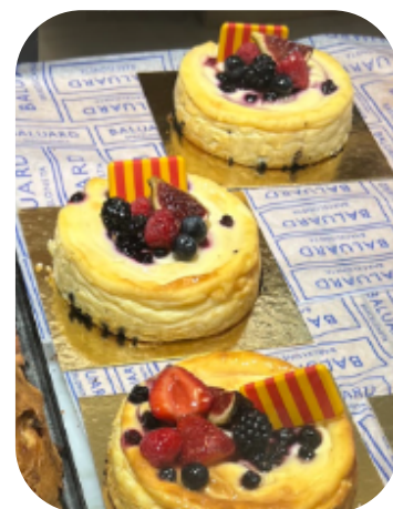
Fig. 9. Cheesecake topped with senyeres

for accessories that typically are one or more levels removed from the body. For example, the senyera -topped cheesecake in fig. 9 was made for la Diada and sold near the march route. However, the object itself was unrelated to the march, suggesting that this was a more appropriate context for an emblem that is not explicitly pro-independence.