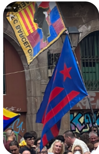
Fig. 4. The estelada blaugrana , carried during the ANC’s 2022 Diada march.

To commemorate the tricentennial of la Diada in 2014, Jordi Avià and Joan-Marc Passada designed the bandera negra (black flag), as seen in fig. 5. The designers explained in an interview that this new pro-independence flag represents the “all-out political combat position” of el Procés , a “fight without truce” for separatist ideals (Rocalva, author’s translation). Avià and Passada go on to describe, “The cross is the cross of Santa Eulàlia [co-patron saint of Barcelona], worn by soldiers in the War of Spanish Succession, and the star is that of the estelada ” (Rocalva, author’s translation).