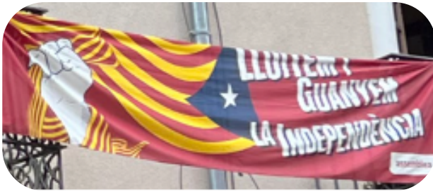
Fig. 25. “ Lluitem i guanyem la independència ” (Let’s fight and win independence), with an estelada .