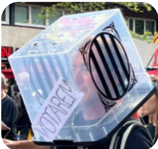
Fig. 27. Voting urn, “ Votarem ” (We will vote).

Fig. 27 shows a noteworthy example of a rare Independence artifact with the senyera : a replica of the voting urns used during the 2017 independence referendum with a message saying “ Votarem ” (We will vote). The real urns used during the referendum did, in fact, contain senyeres . In the context of an official referendum, it would not have been reasonable to show bias toward independence with an estelada .