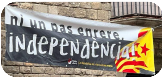
Fig. 26. “ Ni un pas enrere, independència! ” (Not a single step back, independence!), with an estelada vermella .

Fig. 27 shows a noteworthy example of a rare Independence artifact with the senyera : a replica of the voting urns used during the 2017 independence referendum with a message saying “ Votarem ” (We will vote). The real urns used during the referendum did, in fact, contain senyeres . In the context of an official referendum, it would not have been reasonable to show bias toward independence with an estelada .