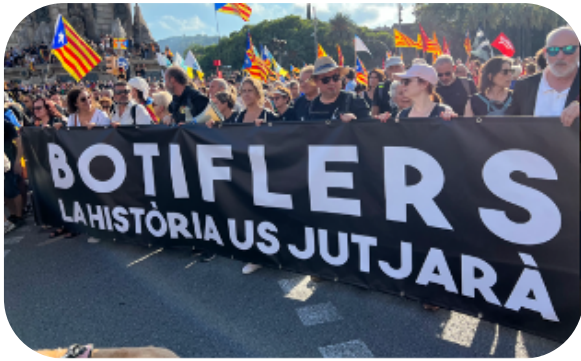
Fig. 20. “Botiflers, la història us jutjarà” (Traitors, history will judge you) with many estelades and estelades vermelles in the background.