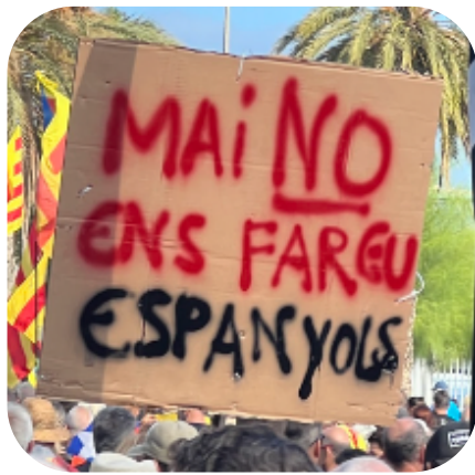
Fig. 31. “ Mai no ens fareu espanyols ” (You will never make us Spanish).

A final point of interest from Table 6 is that while the majority of artifacts for the Independence , Catalan Cultural Identity , and Feminism themes incorporated some form of heraldic imagery (80.1%, 57.7%, and 54.5%, respectively), as well as a near majority of Solidarity artifacts (43.3%), only 16.1% of Betrayal artifacts did. Given that Betrayal artifacts were generally directed at Catalan politicians whom participants believe have acted in opposition to the values represented by those emblems, a possible interpretation is that Diada participants believe that it would be incoherent to place those negative messages alongside Catalan heraldic imagery.