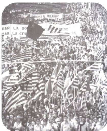
Fig. 7. A sea of senyeres , la Diada 1977.

the data suggest that it is important to display some variation of the estelada or another independence flag in order to “belong” in the contemporary Diada. When considering flags alone, less than 0.3% of individuals carrying flags were carrying senyeres . Of 726 flags of the four types mentioned in Table 3 that were held by individuals in the corpus, only two were senyeres , and one of these was part of an FC Barcelona flag and had an estelada blaugrana directly below it (see fig. 4). The other 724 flags held by individuals were one of the independence-oriented variations. This is in stark contrast to a few decades prior, when images of la Diada were filled with senyeres . Figs. 7 and 8 exhibit this temporal contrast.