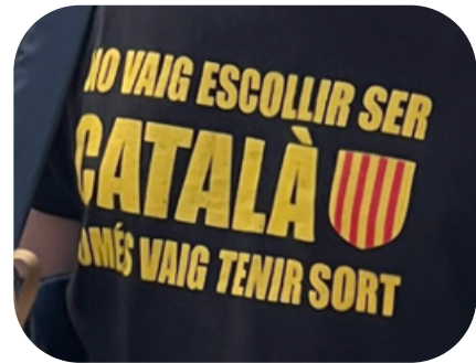
Fig. 28. T-shirt, “ No vaig escollir ser català, només vaig tenir sort ” (I didn’t choose to be Catalan, I just got lucky).

The only theme for which the senyera was more frequent than independence-oriented emblems was Catalan Cultural Identity . Considering the significantly lower presence of senyeres as compared to pro-independence heraldry in the corpus (see Table 2), this finding is striking. Nearly half of the written signs with senyeres dealt with this theme (see, e.g., figs. 28–29).