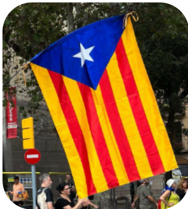
Fig. 2. The estelada , carried during the ANC’s 2022 Diada march.

In the early 20th century, a new flag was developed to reflect growing sentiment and organization surrounding the prospect of Catalan independence. After living through the Cuban victory against Spain, Vicenç Albert Ballester returned to Catalonia and designed the definitive version of this new flag in 1918. The estelada (see fig. 2), from the Catalan estel (star), contains a star design inspired by the Cuban flag that accompanies the quadribarrada pattern of the senyera . According to Albertí, “it is raised by those who defend the independence of Catalonia” (245, author’s translation). It is also known as the estelada blava (blue estelada ).