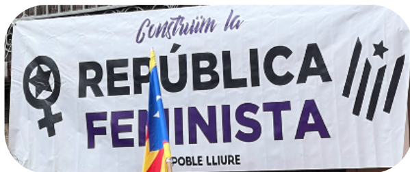
Fig. 17. “Construïm la república feminista” (Let’s build the feminist republic).

Another principal theme in the LL of the 2022 Diada was Betrayal . Of note, these messages were generally not directed primarily against the Spanish state, but rather toward the pro-independence politicians whom Catalan secessionists had elected to represent their interests. Essentially, pro-independence voters are fed up with politicians who promised to fight for independence, yet appear to be compromising too much with the Spanish State at the taula de diàleg (negotiation table). As stated on one poster, “Aragonès 8 (ERC) 9 no us vam votar per fer una taula de rendició. Mentiders i covards, traidors al poble” (Aragonès [ERC] we didn’t vote for you to convene a negotiation table. Liars and cowards, traitors to the people). Dozens of other artifacts also criticized key pro-independence parties and their leaders of being cowards and abandoning the populace who had bolstered their political success (see, e.g., figs. 18–20).