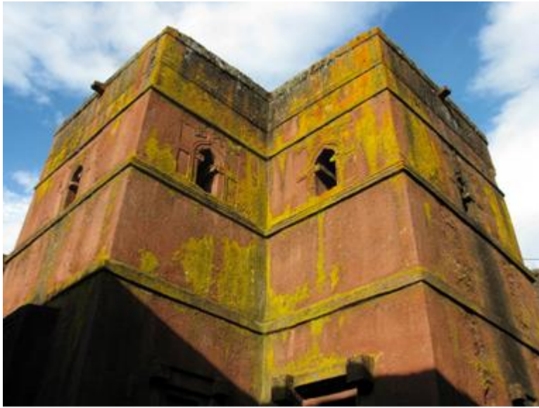
Figure 4: The cruciform church of Beta Giyorgis, Lalibela.