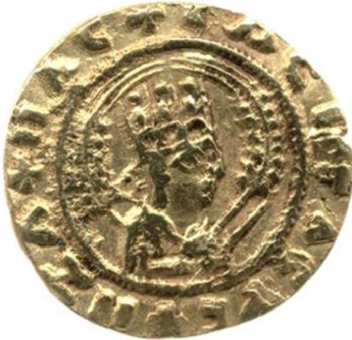
Figure 3: A gold coin featuring Ezana flanked by stalks of wheat with small crosses at the top, bottom, and both sides, c. 340-400.