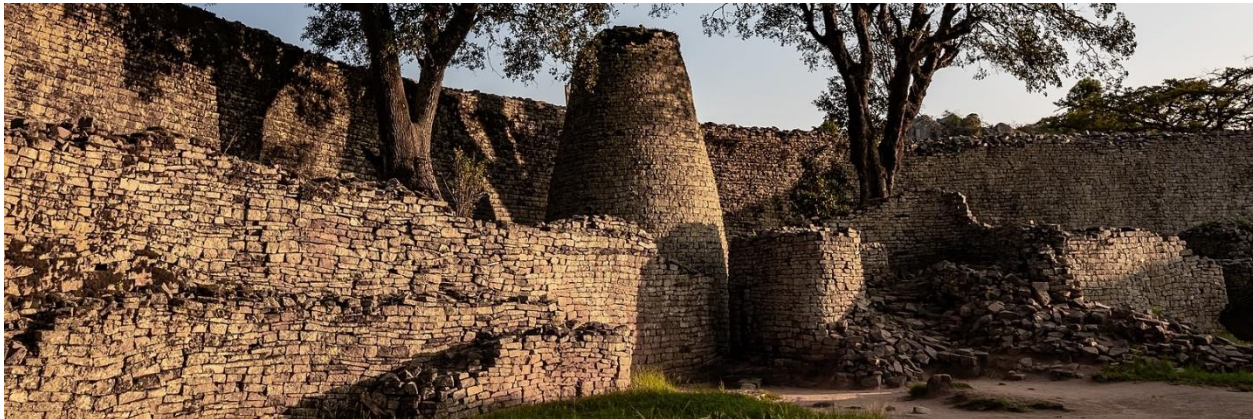
Figure 6: Conical tower in the Enclosure of Great Zimbabwe