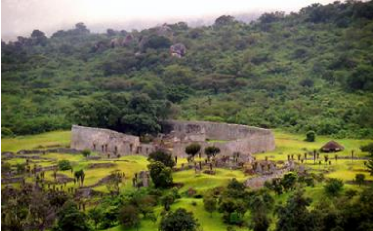
Figure 5: The Enclosure of Great Zimbabwe.