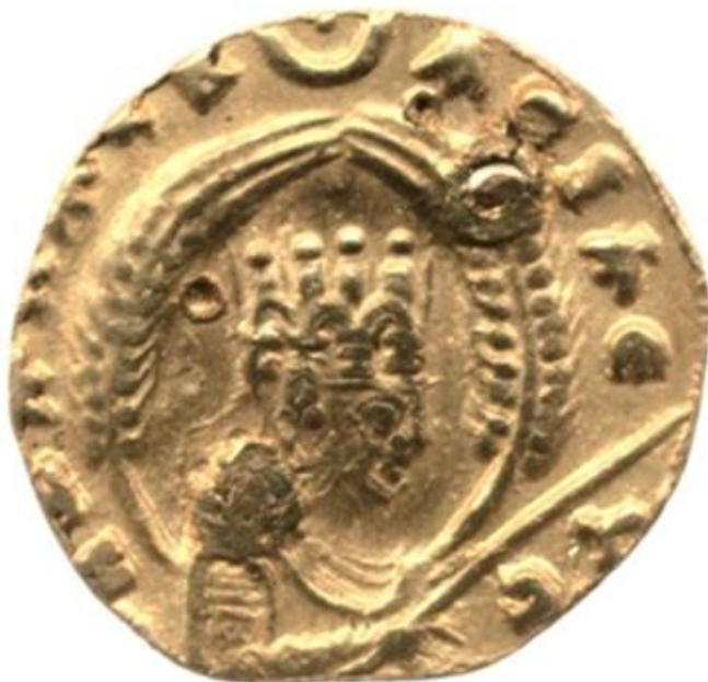
Figure 2: Gold coin featuring Ezana flanked by stalks of wheat with new moon and disc, traditional symbols of the Sabaeen moon god Almaqab, c. 300-340 (British Museum, https://wordpress.org/opensource/image/d725d317-4fb4-4cd1-a01d-096536711fc9/ ).

How else, other than "globalization," can we describe the relatively swift spread of Christianity outside of southwest Asia to east Africa by the middle of the 300s? To help tell this story, my students look at coinage from the reign of Ezana of Aksum (d. c. 356) alongside that of his near-contemporary Constantine (d. c. 337), comparing the ways in which both rulers used pre-Christian iconography and Christian symbolism in their visual language. Both heads of state converted for reasons not completely comprehensible to modern historians but both clearly thrust their images of rulership into a system in