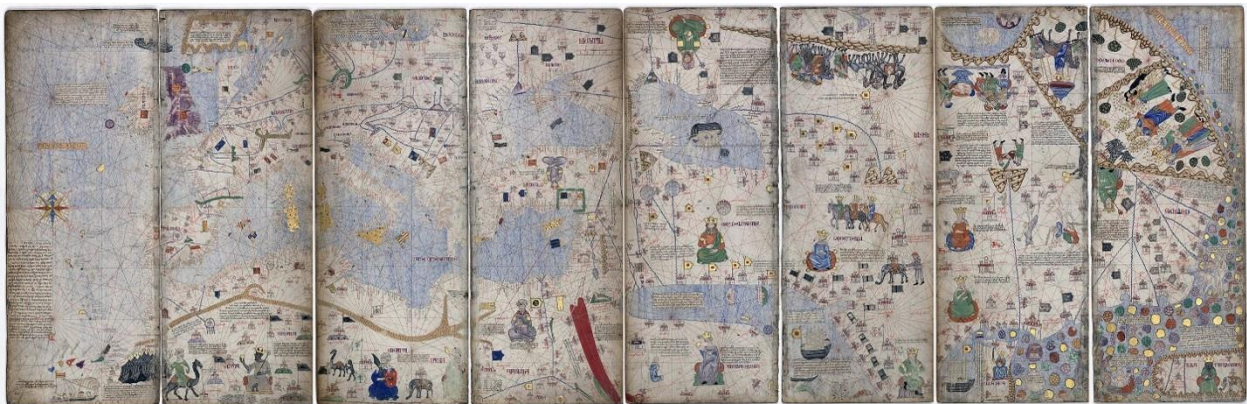
Figure 7: The Catalan Atlas, c. 1375, attributed to Abraham Cresques (1325-1387). Mansa Musa, admiring his gold, is depicted in West Africa.