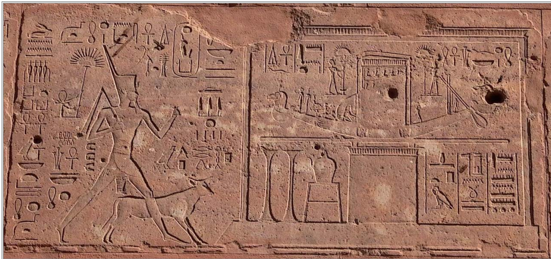
Figure 6. Hatshepsut offering a field to Amun in his processional bark and performing a ritual course with the Apis bull; the processional bark rests in a station sanctuary alongside the processional way (Red Chapel).

During the “Beautiful Feast of the Valley,” Amun met with Mut and Khons (the three deities of the Theban Triad) at Karnak, and together they crossed the river to the west bank, where barks carrying the cult statues of the deified Amenhotep I (“Amenhotep-of-the-Forecourt”) and Ahmose-Nefertari joined them. The procession first visited the reigning king’s “house of millions of years” and then proceeded to the houses of millions of years belonging to former rulers, whose barks also joined the group. Accordingly, the itinerary changed with each new sovereign. The procession’s ultimate destination was Deir el-Bahri, which in essence is a sanctuary of Hathor. The deceased of the Theban necropolis were believed to partake in this procession and to benefit from the gods’ passing by their tombs. In the aforementioned Abydene Khoiak festival, the deceased were also thought to benefit from the divine passing by. Horus and Hathor’s journey to the Edfu necropolis is a further parallel.