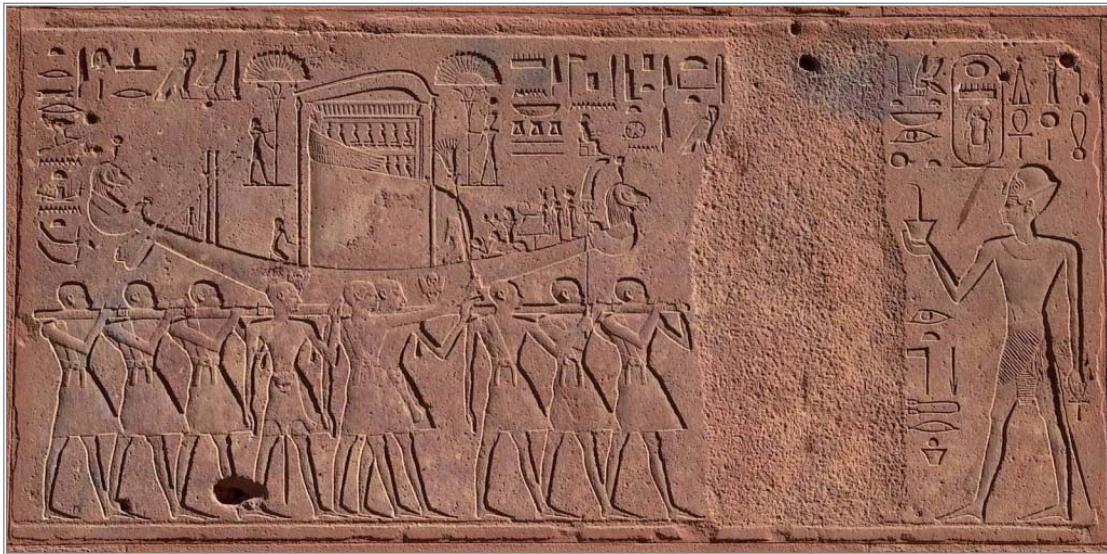
Figure 4. Hatshepsut (now hacked out) welcoming the procession, and Thutmosis III censing before the processional bark of Amun carried by priests (Red Chapel).