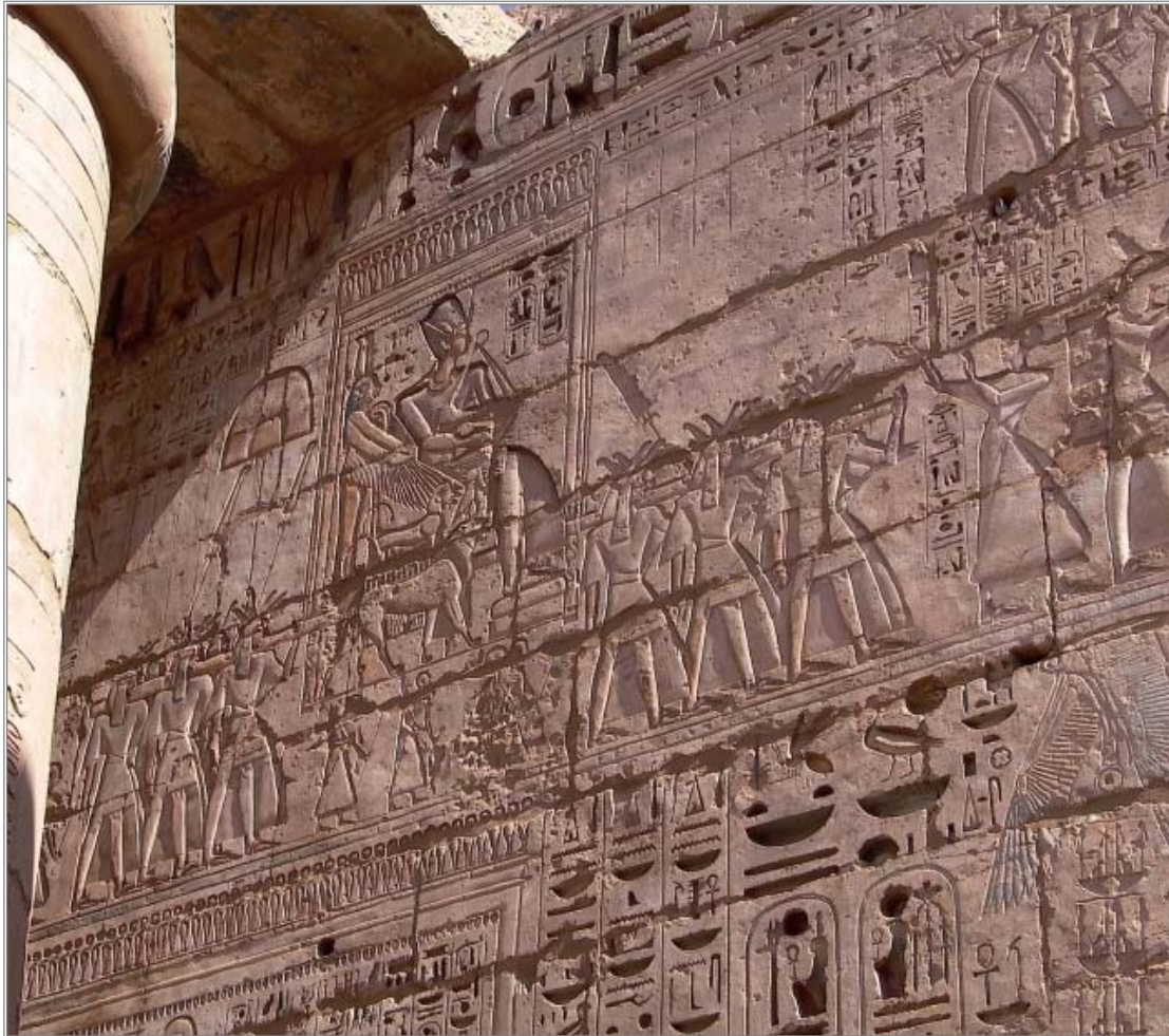
Figure 1. Ramesses III leaving the palace in a palanquin carried by princes and officials during the festival of Min (Great Temple of Ramesses III, Medinet Habu, second court).

processional routes in that period. In fact, the bulk of source material dates to the New Kingdom and particularly to the Ptolemaic Period. This bias in the chronological distribution of the surviving material has, consequently, a bearing on the relative validity of our interpretations and reconstructions. Despite this caution, we may surmise that the basic features of processions were similar before, during, and after the New Kingdom. The so-called Khoiak Festival at Abydos may stand as evidence. For the Middle Kingdom, the procession of the underworld god Osiris during the Khoiak Festival is well documented. The procession can be reconstructed as follows: It left the god's temple at Abydos to visit his desert burial