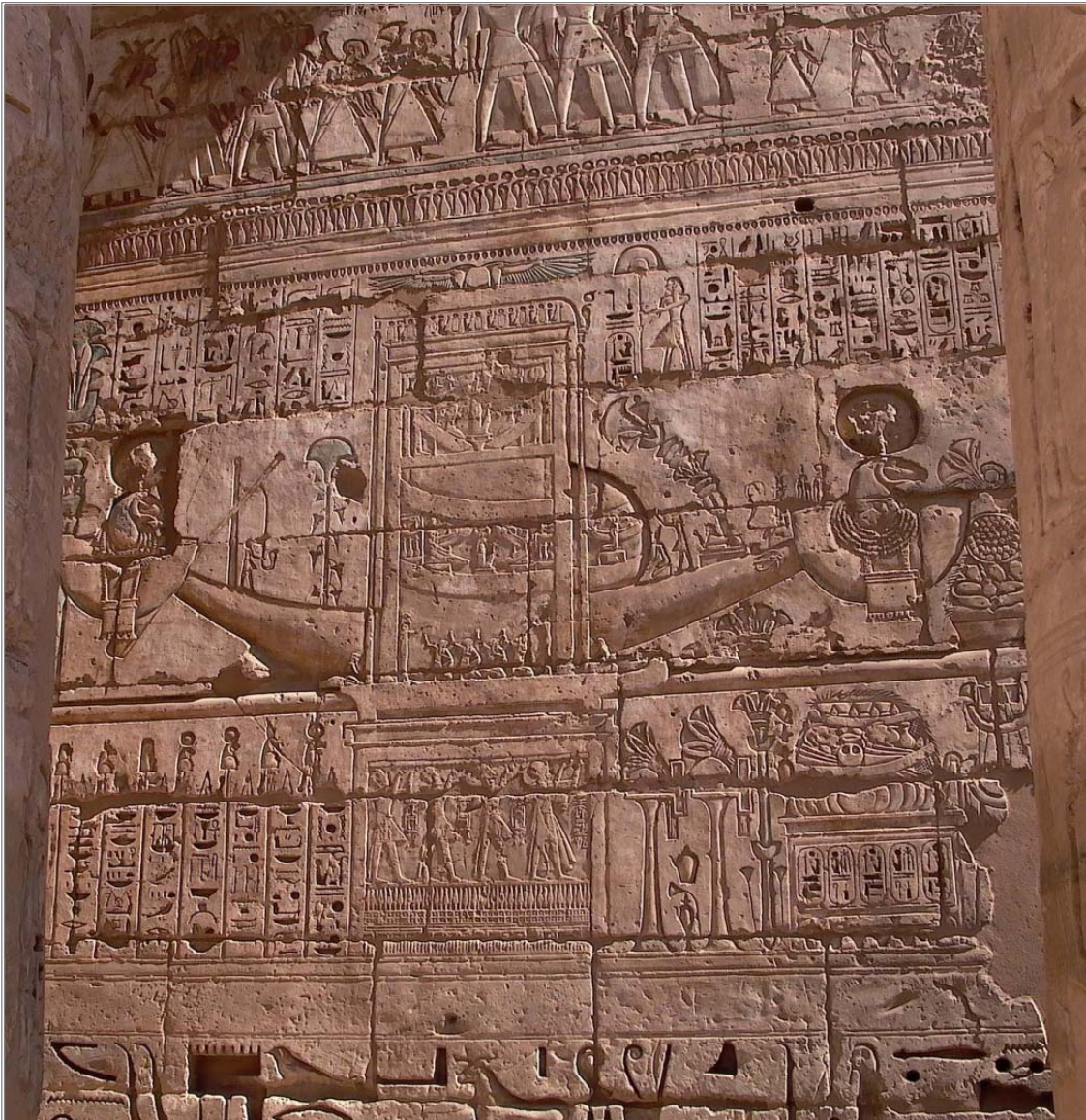
Figure 2. The processional bark of Amun Userhat (Great Temple of Ramesses III, Medinet Habu, second court).