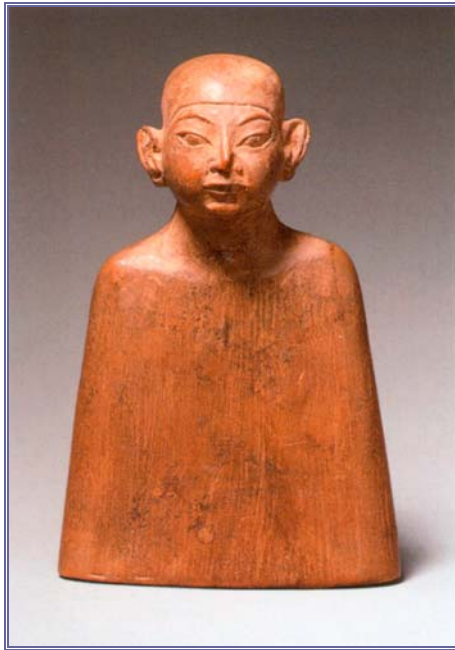
Figure 1. Small (78 mm) wooden ancestor bust without a wig, from Deir el-Medina, 18 th Dynasty, reign of Akhenaten.