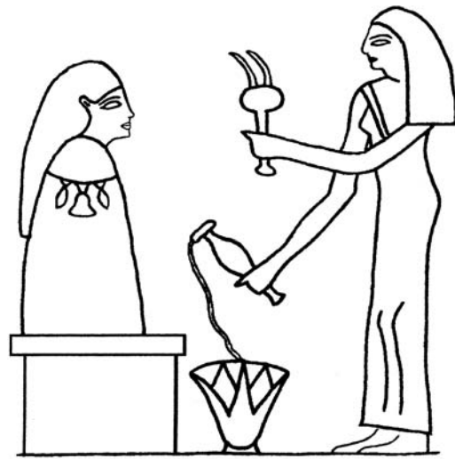
Figure 3. Limestone stela depicting the Lady of the House, Henut, offering incense and water to an ancestor bust. From Deir el-Medina.