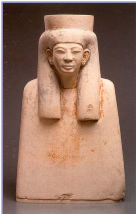
Figure 2. Large (262 mm) limestone ancestor bust with wig and modius, possibly from Deir el-Medina, late 18 th -early 19 th Dynasty.

The presumed use and meaning of the busts have been influenced by the assumption of a predominantly domestic context and hampered by the fact that only four of the 150 examples are inscribed (Keith-Bennett 1981a: 48 - 50). Friedman (1985) has argued that the busts constituted the focal point of the ancestor cult rites, thereby continuing the tradition, documented since the Old Kingdom, of the living presenting offerings to the recently deceased. According to this interpretation, the busts represented or embodied the ꜣh-jkr , the “excellent spirits,” to whom the ꜣh-jkr n Rꜥ -stelae were also dedicated (Demarée 1983). The anepigraphic busts at Deir el-Medina were identified by associated inscribed objects, such as the headrests, offering tables, and ꜣh-jkr n Rꜥ -stelae found alongside them. A variant suggestion (Harrington 2003) argues that the majority of the busts represent women (based on the presence of the tripartite wig) and form the counterpoint to the ꜣh-jkr n Rꜥ -stelae, which are almost wholly dedicated to men. These interpretations also place the busts within the network of artifacts associated with