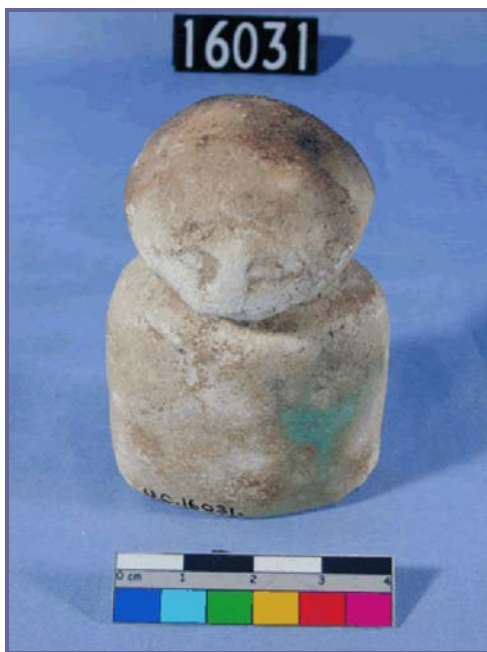
Figure 5. Small limestone (?) bust, with traces of blue paint, from Kom Medinet Ghurab.

the ancestor cult, centered on the concept that the recently deceased could impact—positively or negatively—on the living. Included in this network of artifacts are the Letters to the Dead, which gave voice to the concept. The busts were tangible intermediaries between this world and the world of the supernatural, of the dead and the gods, and provided magical protection for the living (Meskell 2003: 46)—protection being perhaps especially pertinent at Deir el-Medina, where many of the men worked away from the village much of the time. However, it is possible that the busts had additional cultic functions that have yet to be defined (Keith-Bennett 1981a: 50). The anonymous nature of the busts would have allowed them changing contextual identifications and functions. “Anthropoid bust” may be a more appropriate term for these artifacts.