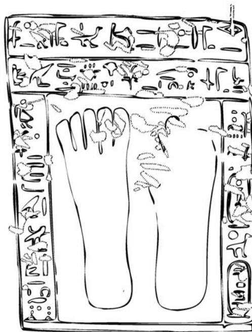
Figure 2. Foot graffiti with text and box around it.

The range of figures bearing figural graffiti is immense and often exhibits some connection to the location in which the figures were found. Thus sites that had religious significance, such as temples and shrines, may feature a large number of representations of deities—either anthropomorphic images or examples of animals sacred to the local deity (rams, vultures, falcons, bulls, and the like are all seen in various contexts). One complicating aspect of the role of figural graffiti in temple areas is the question of whether the exterior walls, where most of these graffiti are found, bore official decoration (scenes and/or hieroglyphic inscriptions), for we find examples where people emulated already existing decorations by replicating, for example—and usually on a smaller scale—a deity (standing or seated on a throne), an offering table, a sacred bark (fig. 3), or a flower bouquet. In many cases the quantity and size of the graffiti were contingent on the amount of relatively flat space available. In quarries and in way-stops on caravan routes, figural graffiti depicting the "composer" are common (fig. 4), as are depictions of desert animals, cattle, donkeys, and camels.