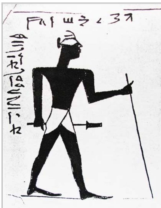
Figure 4. "Composer" graffito from Hatnub.

Over time some sites became contested areas, competed over by several parties. A classic example of this is the Temple of Isis on the island of Philae (Cruz-Uribe 2002; Frankfurter 1998), where Egyptians, Nubians, Greeks, Romans, and later Coptic Christians, each claimed access and rights to all or part of the island. Each group had its own priority and wrote its own culturally designated graffiti there (mostly textual, although some figural examples are present). A similar situation can be found in the royal tombs in the Valley of the Kings: on the tomb walls we frequently find examples of textual graffiti left by Greek, and Greek-speaking Egyptian, visitors, as well as some figural graffiti. Later the Coptic Christians usurped these spaces, converting the tombs into sites dedicated to local martyrs (for example, the martyr Appa Ammonias in the tomb of Ramses IV) by drawing abundant crosses and figures of the local saint (fig. 5).