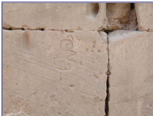
Figure 3. "Emulation" of Khonsu bark figure. West exterior wall of Khonsu Temple, Karnak.

of such boxes has not been studied in depth, but their presence may prove useful for dating and placement purposes and may also provide a means of connecting textual graffiti with figural forms. We also find numerous signs of religious significance, such as pilgrims' feet in and around pilgrimage destination sites (mainly tombs and temples), and religious images on the exterior walls of temples (such as the Khonsu Temple at Karnak), where the general populace honored the local temple gods (fig. 2).