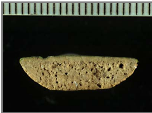
Figure 1. Cross section through a faience inlay from Tell el-Amarna. The upper surface, a thin layer of greenish glaze, tops a layer of very fine faience and a coarse layer beneath. This piece was probably glazed by efflorescence.

so be crushed and added unintentionally with the sand itself). Where plant ash soda was used the coarse material from the ashing of the plants would have to be picked or sieved out before crushing the remainder. The materials would then be mixed together in approximately the ratio presented above. The paste produced was thixotropic—that is, subject to changes in viscosity that would make it difficult to shape and prone to losing detail.