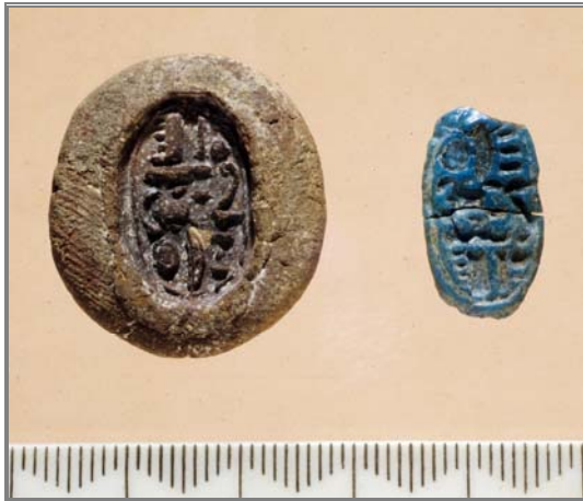
Figure 2. Clay mold (left) for making a faience ring bezel (right). Note that the hieroglyphs are less clear on the bezel than in the mold. This is a common problem in faience manufacture.

sufficient to facilitate throwing. Wheel throwing has been argued for the Ptolemaic and Roman periods in particular, when clay may have been included in the faience body, but there has been no agreement about whether the wheel was actually used.