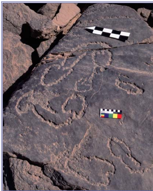
Figure 10. Cluster of Epi-palaeolithic labyrinth-fish-trap motifs from el-Hosh.

2009). Dating to the very end of the Palaeolithic, the so-called “Epi-palaeolithic” (c. 7000 - 5500 BCE), are most probably the bizarre-looking mushroom-shaped designs that characterize the rock art of el-Hosh, about 30 km south of Edfu (fig. 10) (Huyge 2005; Huyge et al. 2001, 1998). Frequently appearing in clusters and occasionally as isolated figures, these designs, which can tentatively be interpreted as representations of labyrinth-fish-traps, are often associated with abstract and figurative motifs, including circles, ladder-shaped drawings, human figures, footprints, and crocodiles. Probably affiliated “geometric” rock art assemblages are known from Sudanese Nubia (Abka) and have recently also been reported from the Aswan area (Storemyr 2008). The occurrence of similar rock art at several locations in the Eastern Desert (and possibly also at Dakhla, Farafra, and Siwa in the Western Desert) suggests that the Epi-palaeolithic image-makers were extremely mobile and must have lived a nomadic existence. Rock art examples pre-dating the Epi-palaeolithic have recently been discovered at three locations in the Upper Egyptian Nile Valley: Abu Tanqura