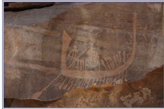
Figure 5. Late Predynastic boat representation. Wadi Abu Subeira.