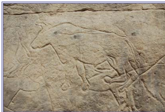
Figure 11. Detail of late Palaeolithic rock art panel showing bovids. Qurta.

2009). Dating to the very end of the Palaeolithic, the so-called “Epi-palaeolithic” (c. 7000 - 5500 BCE), are most probably the bizarre-looking mushroom-shaped designs that characterize the rock art of el-Hosh, about 30 km south of Edfu (fig. 10) (Huyge 2005; Huyge et al. 2001, 1998). Frequently appearing in clusters and occasionally as isolated figures, these designs, which can tentatively be interpreted as representations of labyrinth-fish-traps, are often associated with abstract and figurative motifs, including circles, ladder-shaped drawings, human figures, footprints, and crocodiles. Probably affiliated “geometric” rock art assemblages are known from Sudanese Nubia (Abka) and have recently also been reported from the Aswan area (Storemyr 2008). The occurrence of similar rock art at several locations in the Eastern Desert (and possibly also at Dakhla, Farafra, and Siwa in the Western Desert) suggests that the Epi-palaeolithic image-makers were extremely mobile and must have lived a nomadic existence. Rock art examples pre-dating the Epi-palaeolithic have recently been discovered at three locations in the Upper Egyptian Nile Valley: Abu Tanqura