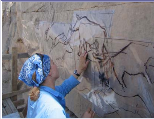
Figure 3. Tracing late Palaeolithic petroglyphs. Qurta, 2007.