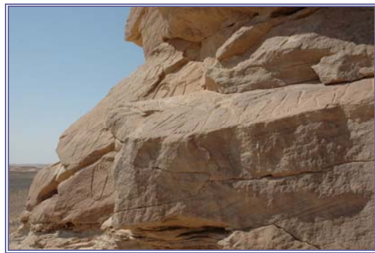
Figure 9. Schematic outlines of feet, typical of Pharaonic rock art. Kharga Oasis.

drawn carts or chariots, and schematic figures of humans and camels.