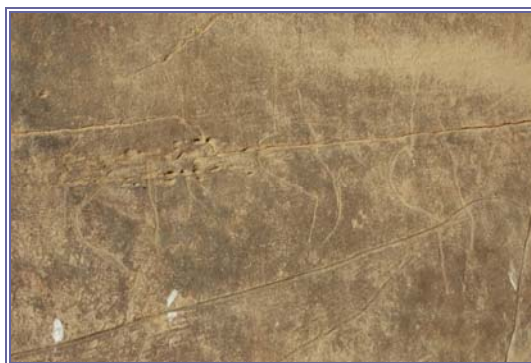
Figure 12. Detail of late Palaeolithic rock art panel showing three highly stylized human figures. Qurta.

Bahri at el-Hosh (Huyge 2005), Qurta (Huyge 2008; Huyge and Claes 2008; Huyge et al. 2007), and Wadi Abu Subeira (Storemyr et al. 2008). The rock art repertoire at these sites is fundamentally different from the Epi-palaeolithic assemblages and consists for the most part of naturalistically drawn animal figures. Bovids (wild cattle or aurochs) are largely predominant (fig. 11), followed by birds, hippopotamuses, gazelle, fish, and hartebeest. In addition, there are also several highly stylized representations of human figures (fig. 12) and a small number of probable non-figurative or abstract signs. For the time being, the dating evidence is entirely circumstantial, but it is likely that this rock art is late Palaeolithic in age. A date of about 15,000 BCE has tentatively been proposed. If this is correct, this rock art is not only Egypt’s most ancient art, but one of the oldest graphic traditions known to date from the African continent.