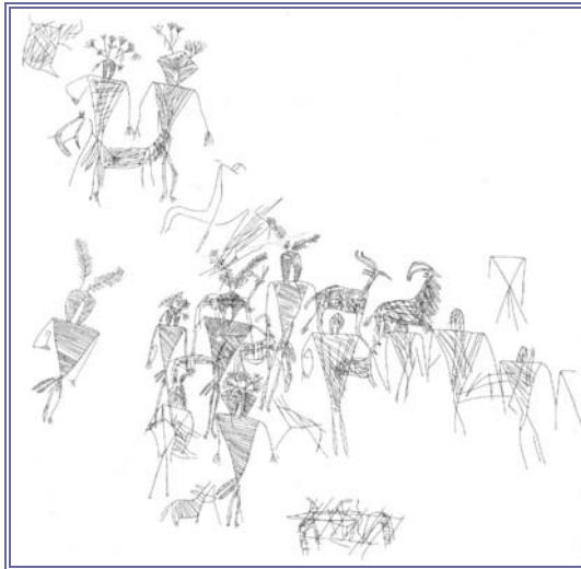
Figure 6. Finely engraved human and animal figures. Theban Desert. Possibly early Predynastic (Tasian or Badarian).

intellectual concepts and structures) was possible and stimulated by society as a whole. This vast rock art repertoire can moreover be intimately linked with the local, archaeologically known cultures. These cultures, both prehistoric and historic, are characterized by an overwhelmingly rich iconography. That the latter have often been found in well-documented archaeological contexts holds great potential, not only with regard to dating and culture-historical attribution of the rock art, but also with regard to interpretation (meaning and motivation).