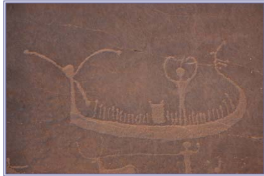
Figure 7. Predynastic representation of high-prowed boat with human figures, ubiquitous in the Eastern Desert. Wadi Barramiya. Probably Naqada II.

The potentialities of Egyptian rock art have been explored at many different locations throughout the above-defined area. One of the places where highly significant discoveries have been made during the past few decades is the Theban Desert immediately northwest of Luxor. In the scope of the Theban Desert Road Survey, John and Deborah Darnell of Yale University have recorded, apart from a wealth of rock inscriptions, an impressive array of early to terminal Predynastic rock art, including depictions of boats, various animals, and superbly detailed human figures (fig. 6) (Darnell 2002a, 2002b, 2009). Much of this rock art is closely linked to ancient caravan