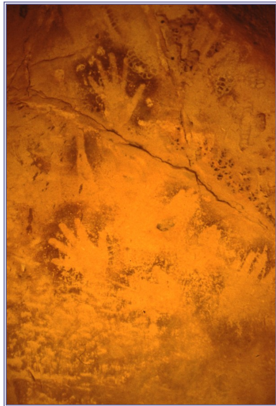
Figure 8. Neolithic (?) hand stencils from Wadi el-Obeiyd Cave. Farafra Oasis.