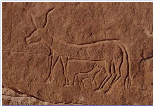
Figure 4. Rock art from Abu Ballas caravan station, 550 km west of the Nile Valley. Probably late Old Kingdom.

this type of research. Imminent threats to rock art throughout the country, both by natural agents and human actions (see, for instance, Huyge 1998), render such research all the more desirable.