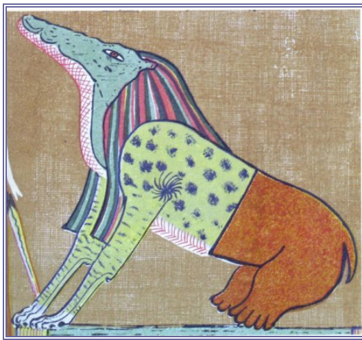
Figure 4. Ammut, “the devourer of the dead”, from Spell 125 of the Book of the Dead .

Egyptological interpretation of demons as minor deities derives from these protective figures, which are often depicted with an animal head on an anthropomorphic or mummified body and holding knives or other weapons in their hands.