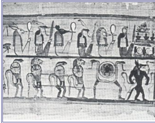
Figure 3. Guardian demons from a Guide of the Netherworld