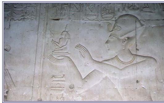
Figure 1. The goddess Maat, wearing an ostrich plume ( mꜣt ) on her head, being offered by Sety I. Abydos, temple of Sety I. Dynasty 19.

Feathers in Religious Iconography and Hieroglyphic Writing