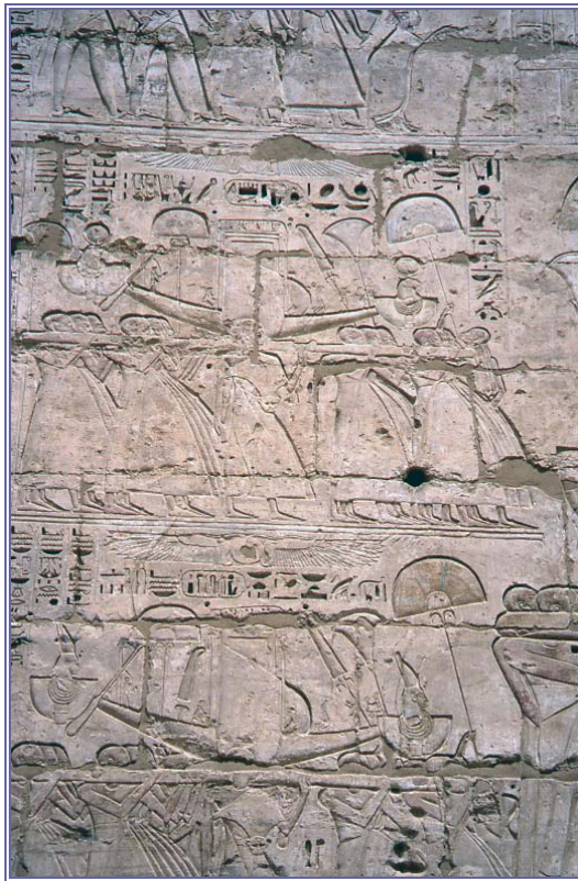
Figure 3. shwt fan over the barques of Khons and Mut denoting the presence of the divine images. Medinet Habu. Dynasty 20.

personification of the West (Seeber 1976: 143 - 144, figs. 23 and 24). In some vignettes of Chapter 125 of the Book of the Dead , the judges