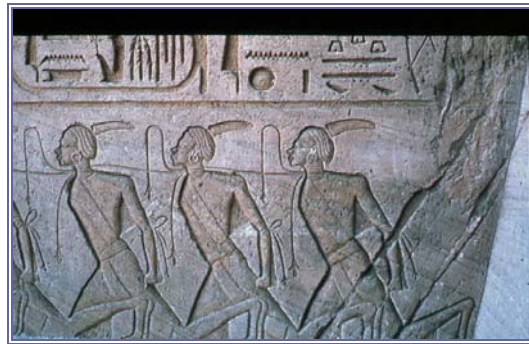
Figure 6. Bound Nubians with a feather on their heads. Abu Simbel. Dynasty 19.

Semi-circular feathered fans on long handles (fig. 3) were held over a divine presence or a divine intermediary to proclaim its presence in processions and festivals (Bell 1985). The phonetic value for “fan” was the same as for shade ( šwt ). In the New Kingdom, šwt became synonymous with the presence of the god, for example, “the shade of Ra had come to rest upon it” or the god’s shade “being upon his head” (Bell 1985: 33). A similar feather fan ( sryt ) served as a military standard for the army and navy (fig. 4; Faulkner 1941). A tall slender fan ( bht/hw or hwyt ) of a single ostrich plume accompanied the king or members of the royal family (Davis 1907: pl. 36) as a sign