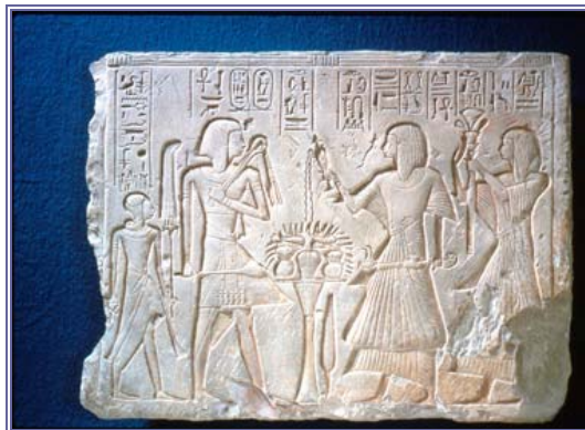
Figure 5. Fan ( bht/hw ) held by prince Ramesses behind his father Sety I. OIM 10507. Dynasty 19.

the feathered wings of the deities Nekhbet and Wadjet encircle the shoulders and chest.