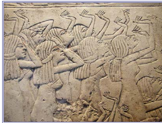
Figure 5. Limestone relief of mourning women, Saqqara, Dynasty 19, Louvre. The women’s loose hair and dresses, and flailing arms and hands, fit the trope of female mourners lamenting the dead.

and dancers may bear tattoos (Fletcher 2005) and are almost nude, with distinctive hairstyles that set them apart from elite women (Robins 1999). Their bodies may likewise adopt more informal postures and gestures, sometimes incorporating rear or frontal views (Müller